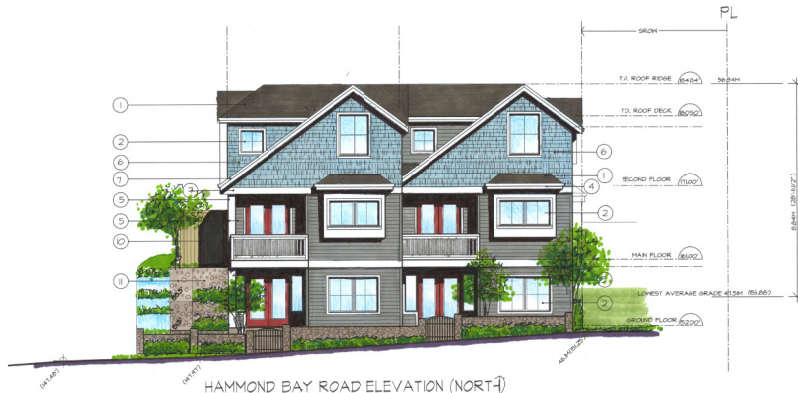
HAMMOND BAY ROAD ELEVATION (NORTH)