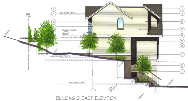
BUILDING 2 EAST ELEVATION