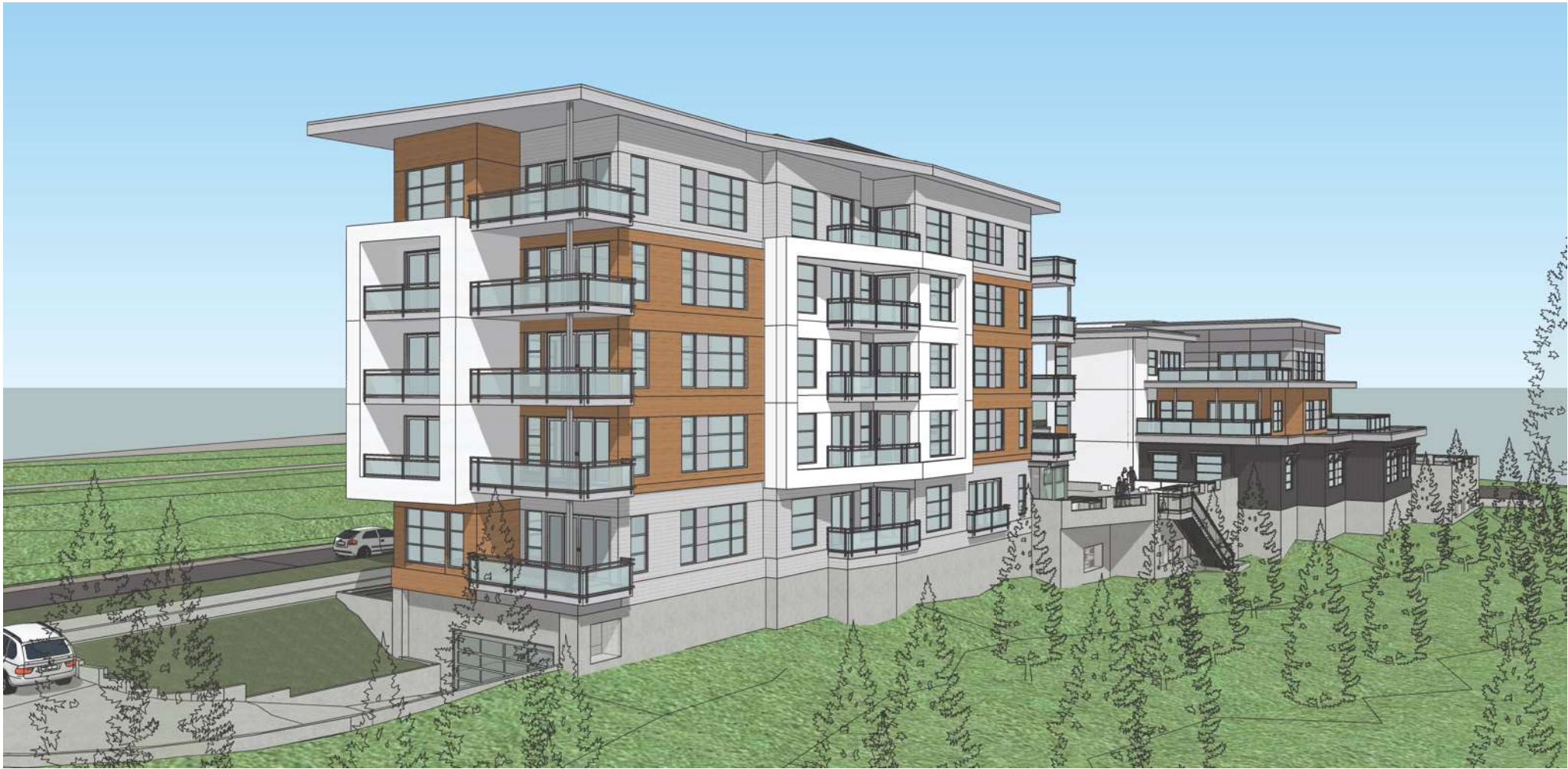
Diver Lake Elevation