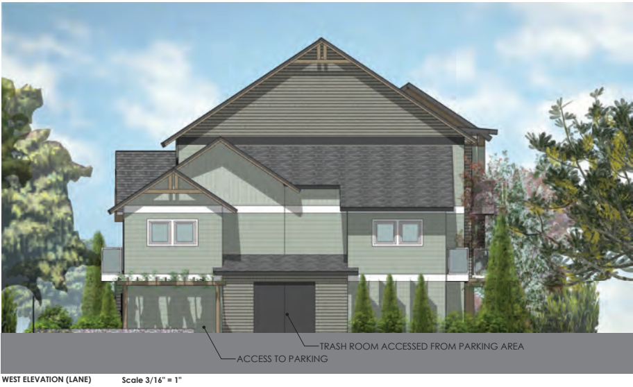
WEST ELEVATION (LANE) Scale 3/16" = 1"