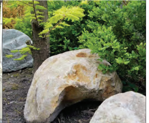
8 Landscape Boulders _____