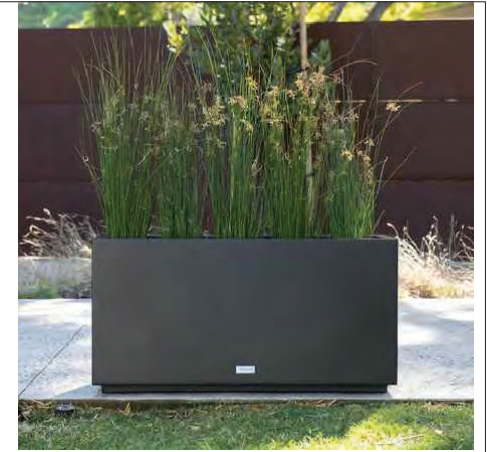
4 Planter Boxes at Entry Doors