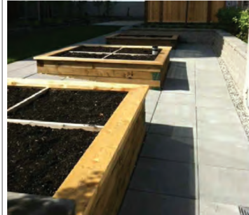
7 Urban Agriculture _____