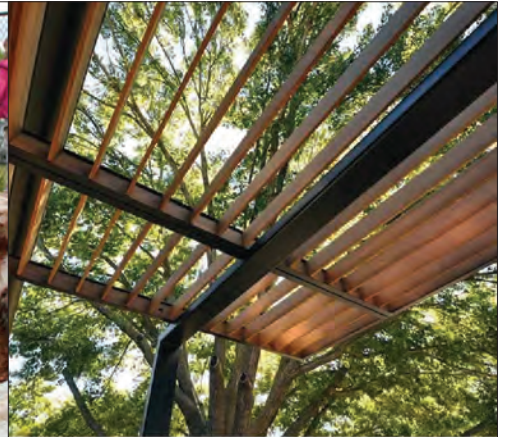
4 Trellis - Black Metal Post and Wood Purlins _____