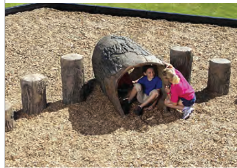
3 Child's Playscape - Logs