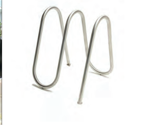
6 Bike Rack _____