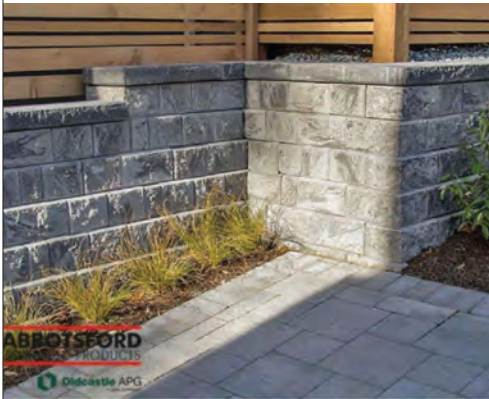
5 Planter Walls and Caps