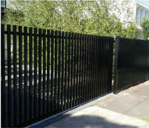
5 6' High Fencing _____