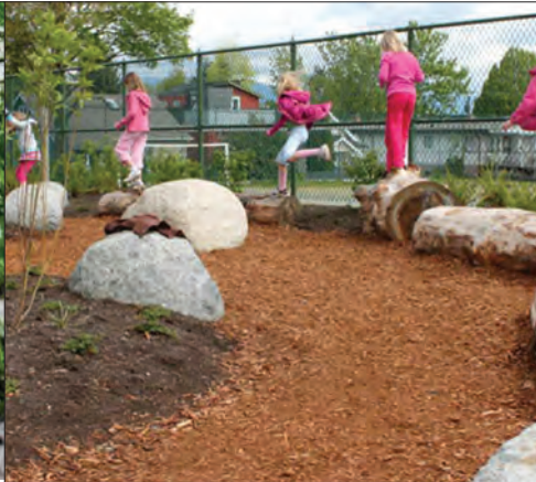
3 Children's Play Area _____