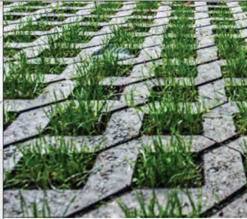
2 Grasscrete _____