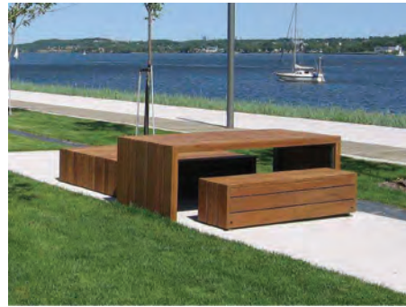
2 Rectangluar Dining Table