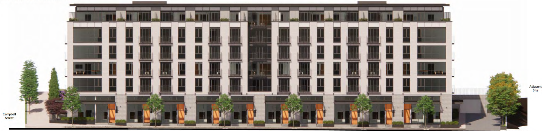
Wallace Street East Elevation