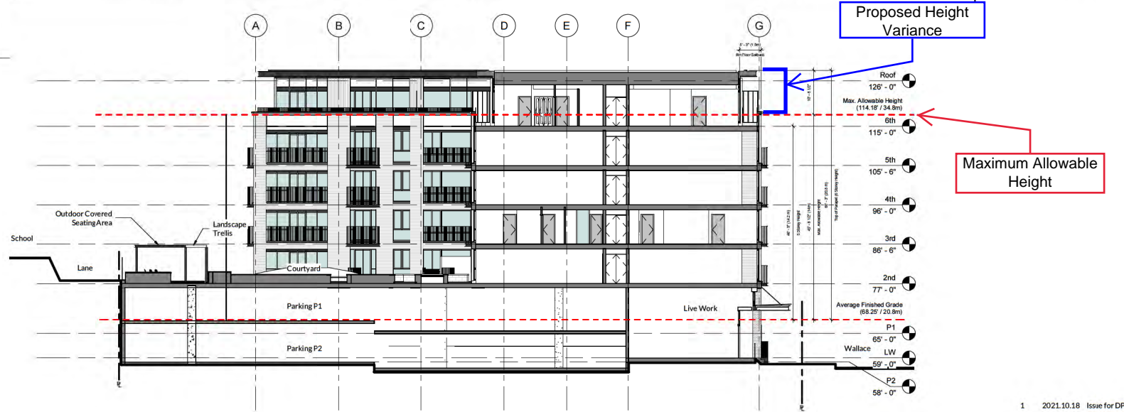
1 Section AA 3/32" = 1'-0"