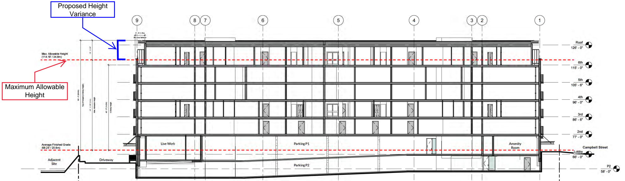
2 Section BB 3/32" = 1'-0"