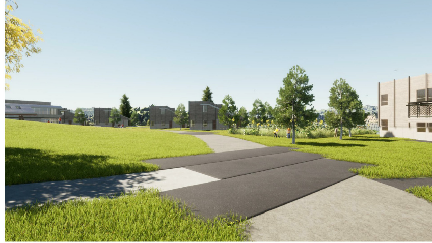
BLOCK GS / BLOCK H