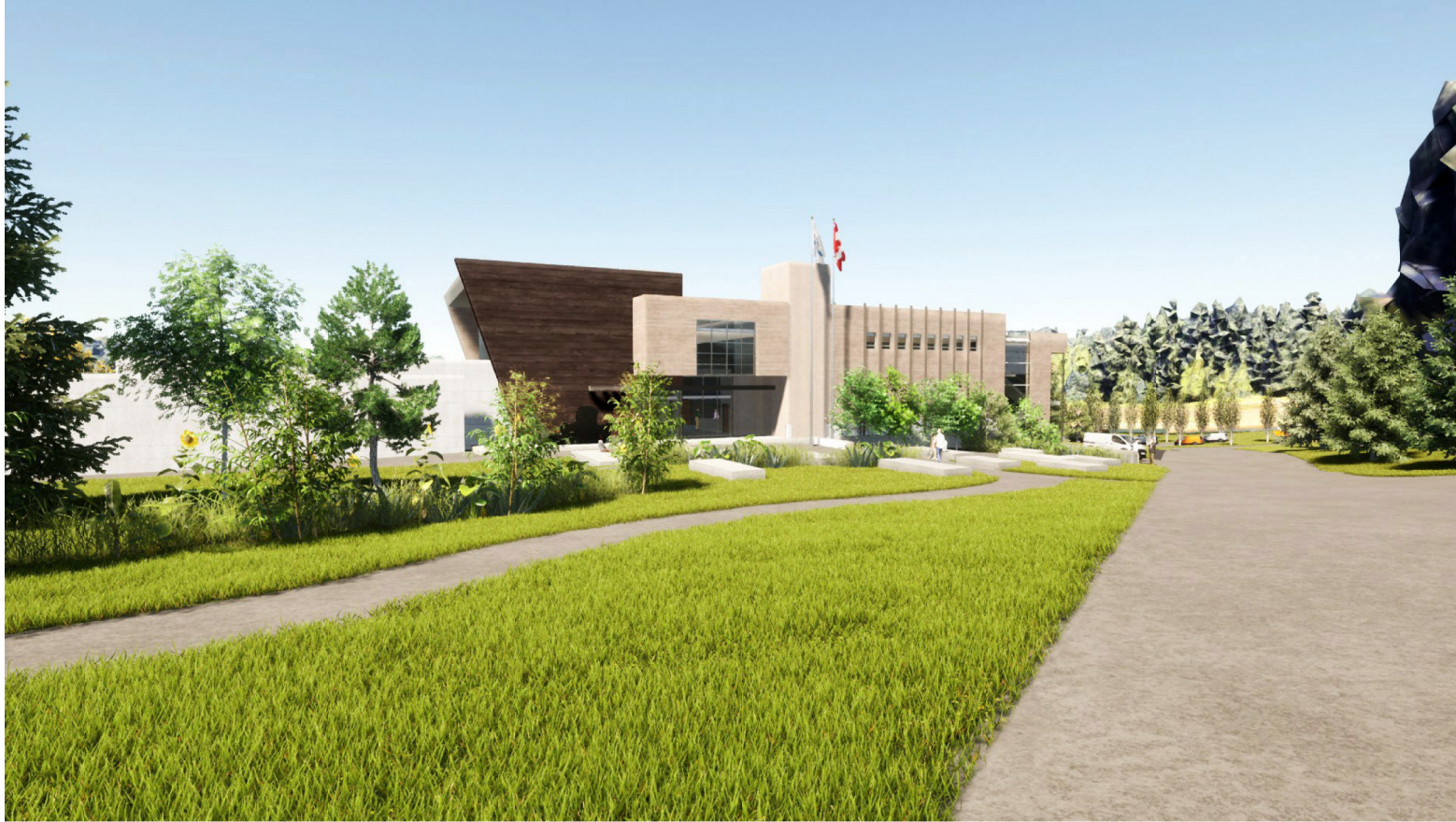
BUILDING AE / MAIN ENTRANCE