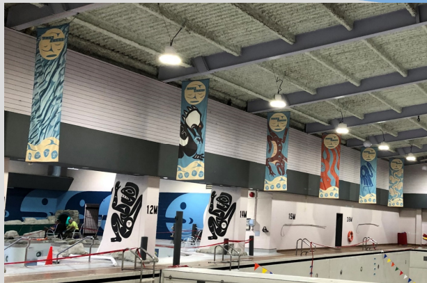
Eliot White-Hill, Sacred Gathering of the Freshwater and Saltwater, 2021