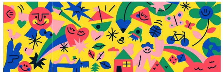
Sebastian Abboud, BC Hydro Box Wraps, 2021