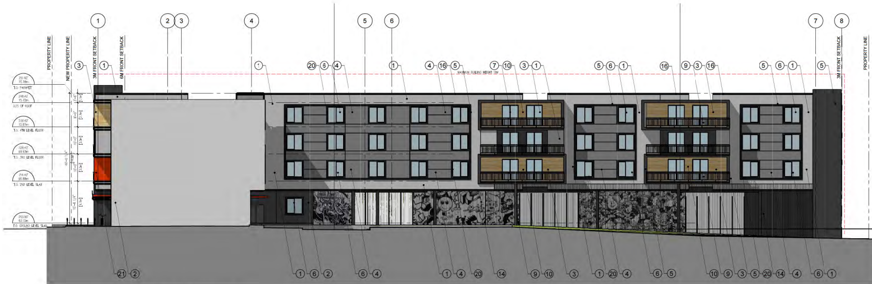
1 SOUTH ELEVATION 2 1/16" = 1'-0"