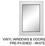
VINYL WINDOWS & DOORS PRE-FINISHED - WHITE