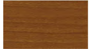
WOODGRAIN HORIZONTAL SIDING COLOUR - SADDLE