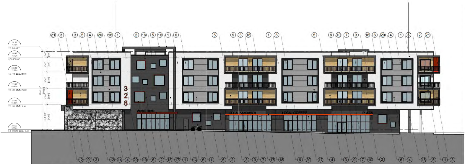
1 WEST ELEVATION 1/32" = 1'-0"