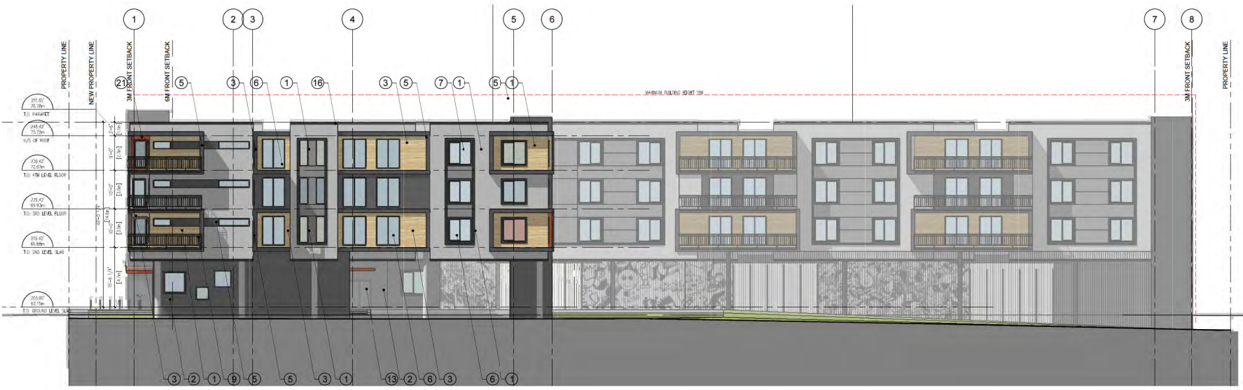
① SOUTH ELEVATION 1 1/16" = 1'-0"