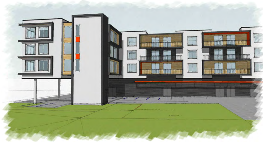
3 EAST PERSPECTIVE