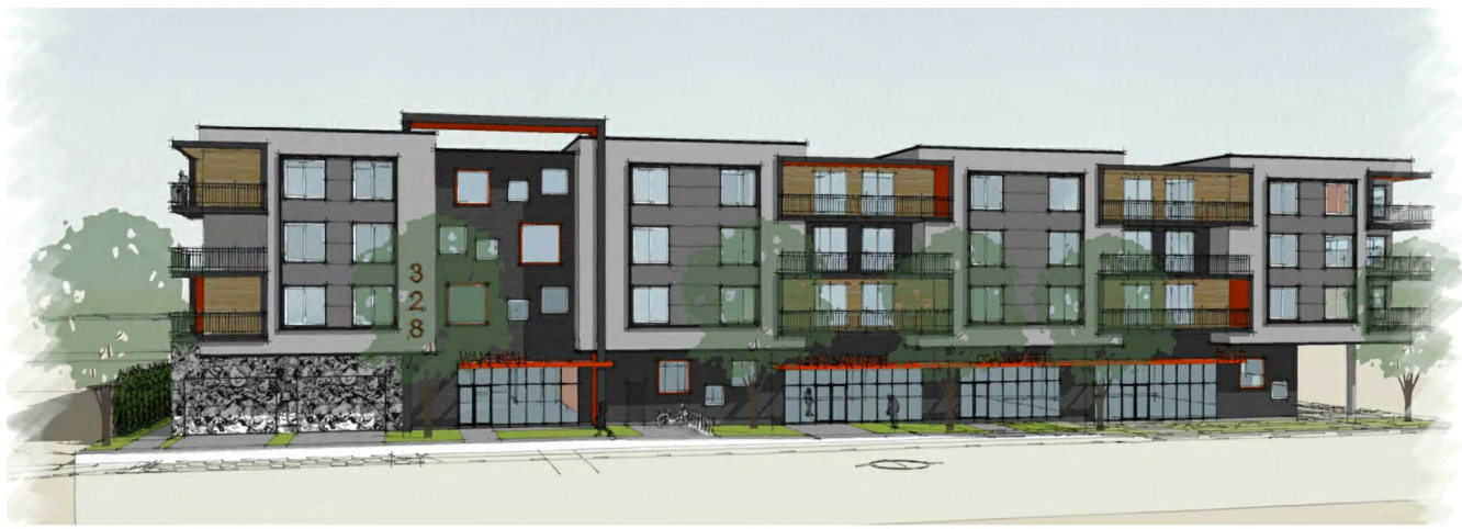
2 WEST PERSPECTIVE N/E

PROJECT NO: 17018 DRAWN BY: XV SCALE: 3/32" = 1'-0" REVIEW BY: DM DWG NO: A3.01