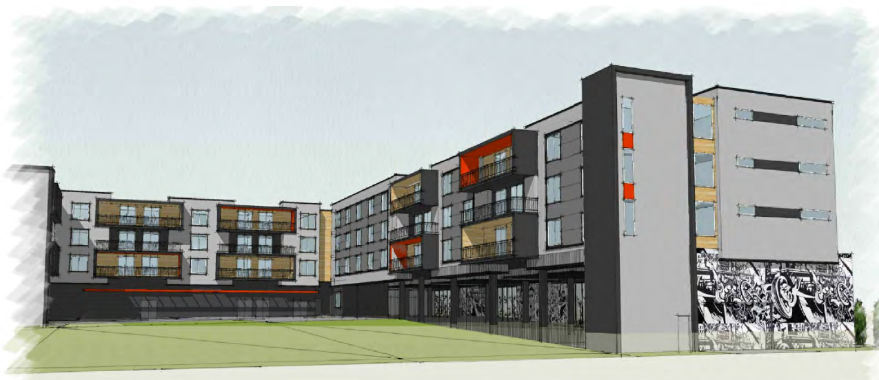
2 SOUTH-EAST PERSPECTIVE NTS

COPYRIGHT RESERVED. ALL PARTS OF THIS DRAWING ARE THE EXCLUSIVE PROPERTY OF IWA ARCHITECTS LTD. AND SHALL NOT BE USED WITHOUT THE ARCHITECT'S PERMISSION. ALL DIMENSIONS SHALL BE VERIFIED BY THE CONTRACTOR BEFORE COMMENCING WORK.