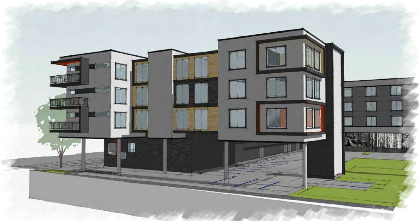
② SOUTH PERSPECTIVE N.T.