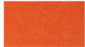
SMOOTH STUCCO WALL FINISH & SOFFIT VIBRANT ORANGE