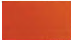
STEEL CANOPY PRE-FINISHED VIBRANT ORANGE