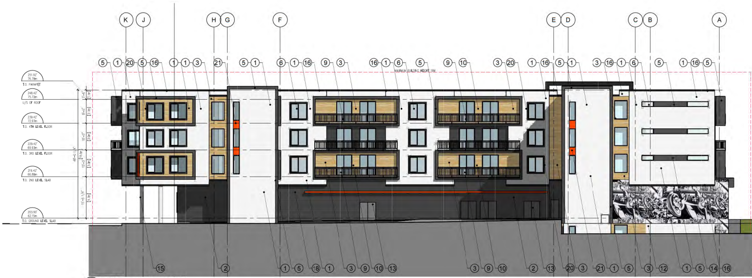
1 EAST ELEVATION

PROJECT NO: 17018 DRAWN BY: XV SCALE: 3/32"=1'-0" REVIEW BY: DM DWG NO: A3.04