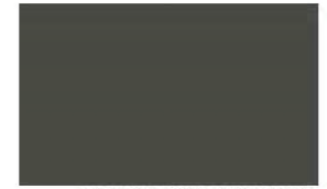
VERTICAL CORRUGATED METAL SQUARE FLUTED COLOUR - CHARCOAL