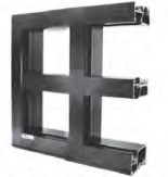
STOREFRONT FRAMING SYSTEM PRE-FINISHED - BLACK