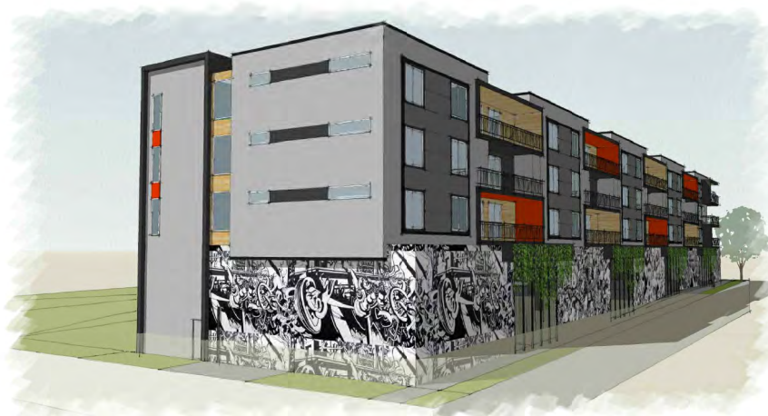
2 NORTH-EAST PERSPECTIVE