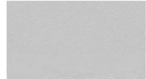
SMOOTH STUCCO WALL FINISH, FASCIA & SOFFIT COLOUR - HORIZON OC-53