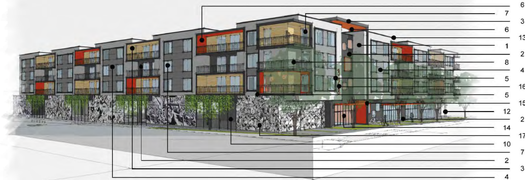
WAKESIAH-NORTHWEST CORNER OF BUILDING