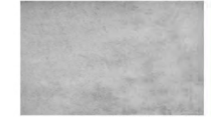
CONCRETE - NATURAL SACK RUBBED

COPYRIGHT RESERVED. ALL PARTS OF THIS DRAWING ARE THE EXCLUSIVE PROPERTY OF IWA ARCHITECTS LTD. AND SHALL NOT BE USED WITHOUT THE ARCHITECT'S PERMISSION. ALL DIMENSIONS SHALL BE VERIFIED BY THE CONTRACTOR BEFORE COMMENCING WORK.