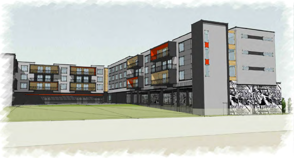
1 COURTYARD 45/02 NTS

PROJECT NO: 17018 DRAWN BY: XV SCALE: NTS REVIEW BY: DM DWG NO: A5.02