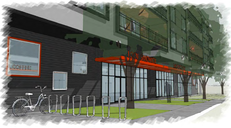
3 COMMERCIAL ENTRANCE VIEW 45/02 NTS