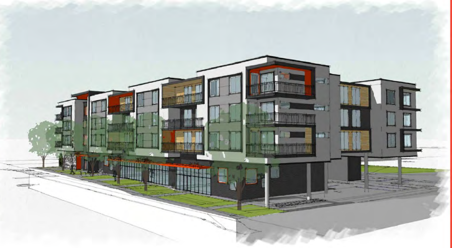
2 SOUTHWEST VIEW 45/02 NTS