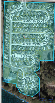
Resort on the Lake 1142 Woss Lake Drive