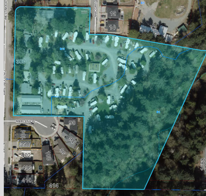
Westwood Lake RV 380 Westwood Road