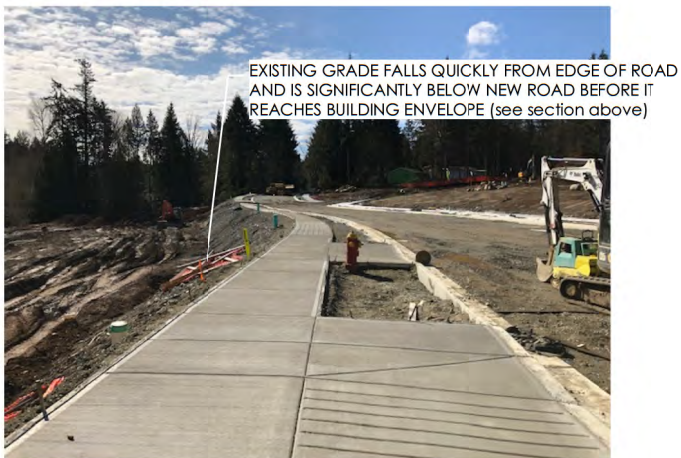
SITE PHOTO - 1 SCALE: NTS