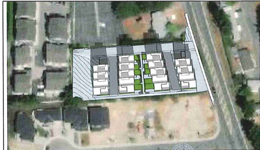
5915 METRAL DRIVE SHADOW STUDY - EQUINOX 12:00 pm HANNAHO, NC SCALE: NTS 20' = 1" = 0'