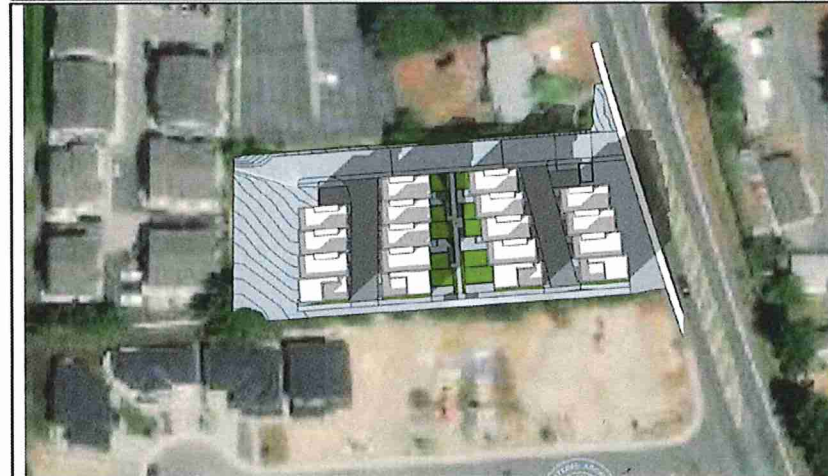
5915 METRAL DRIVE SHADOW STUDY - EQUINOX 3:00 pm HANNAHO, NC SCALE: NTS 20' = 1" = 0'