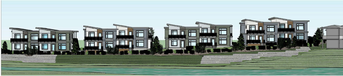
VIEW OF SITE FROM POND (NORTH)