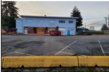
Nanaimo Search and Rescue Value: $2.6M