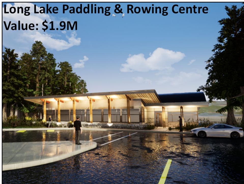
Long Lake Paddling & Rowing Centre Value: $1.9M