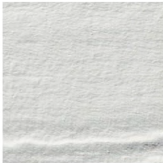
1. Fibre Cement Panel White