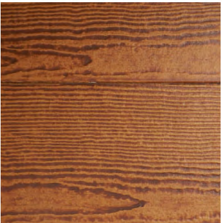
3. Fibre Cement Plank Siding Wood Look