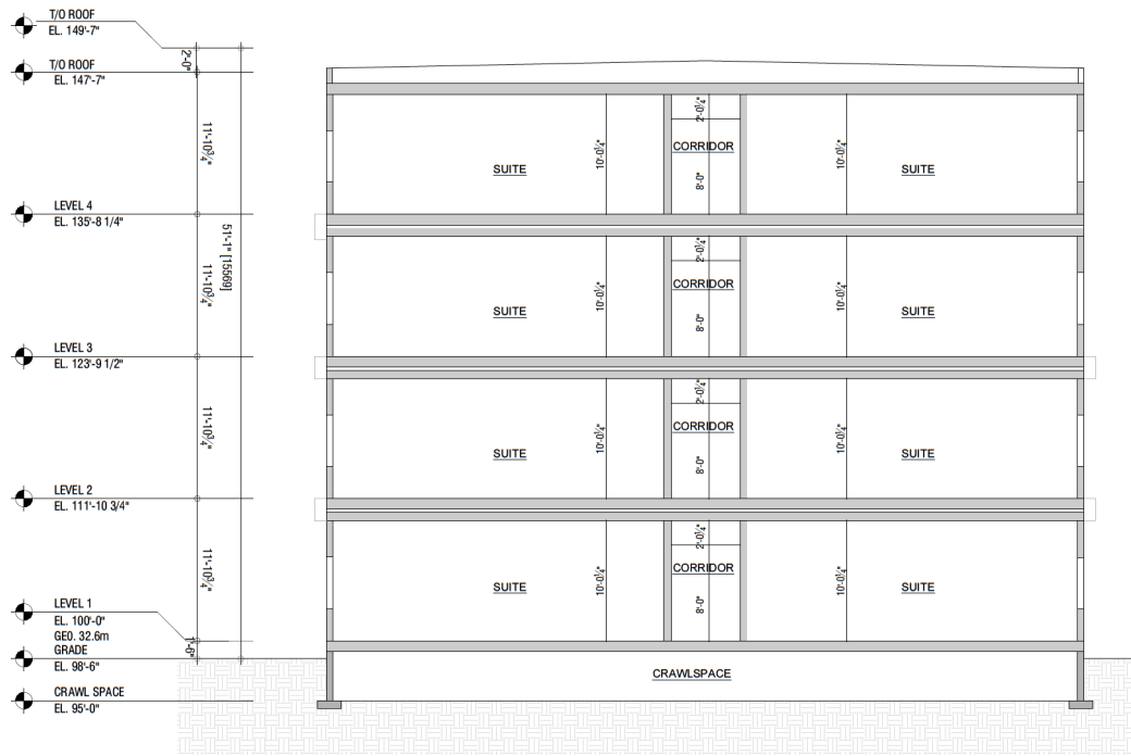
1 SECTION DP4.0 / SCALE: 3/16" = 1'-0"