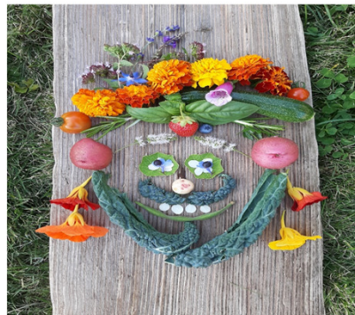
Emergency Food Security Strategy City of Nanaimo Health and Housing Task Force 01-OCT-2020