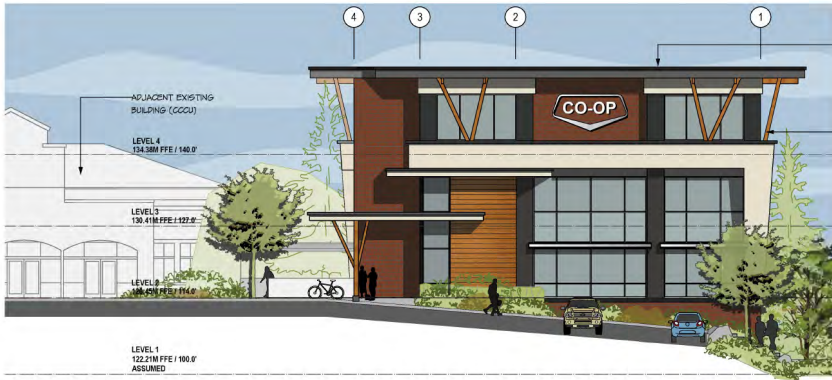
NORTH ELEVATION - FACING PARKING LOT