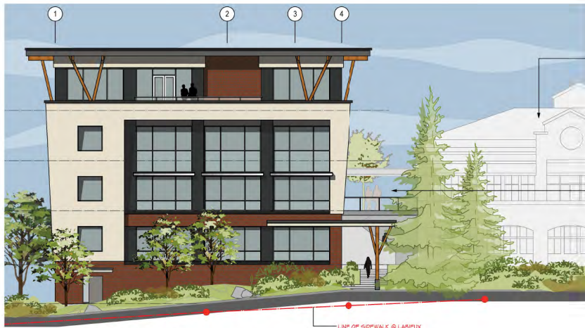
SOUTH ELEVATION - FACING LABIEUX ROAD