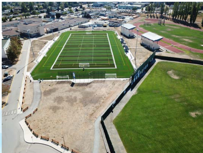
NDSS COMMUNITY FIELD