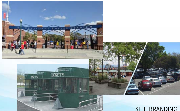
SITE BRANDING / LANDSCAPING PARKING AND TICKETING