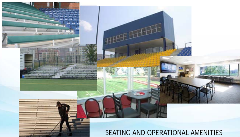
SEATING AND OPERATIONAL AMENITIES