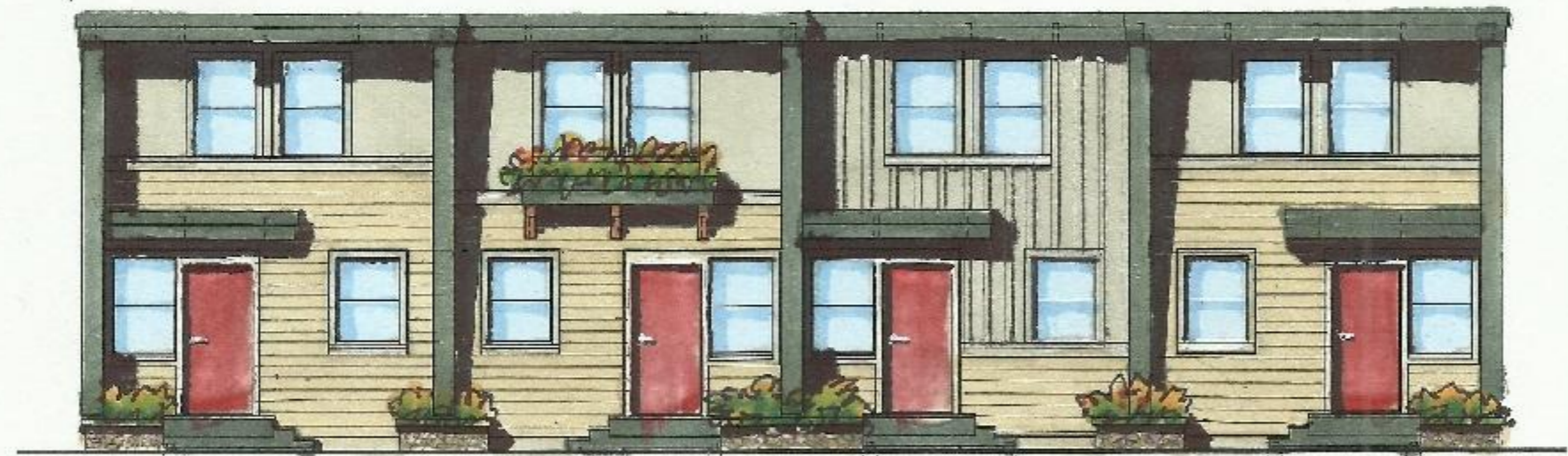
West Elevation Holly Avenue - 1/8" = 1'-0"