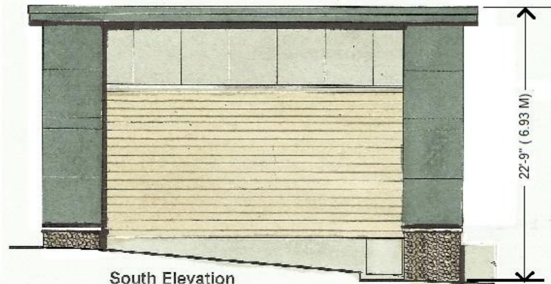
South Elevation SCALE: 1/8" = 1'-0"