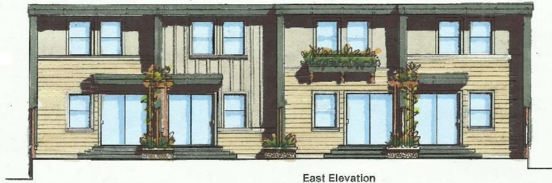
East Elevation SCALE: 1/8" = 1'-0"