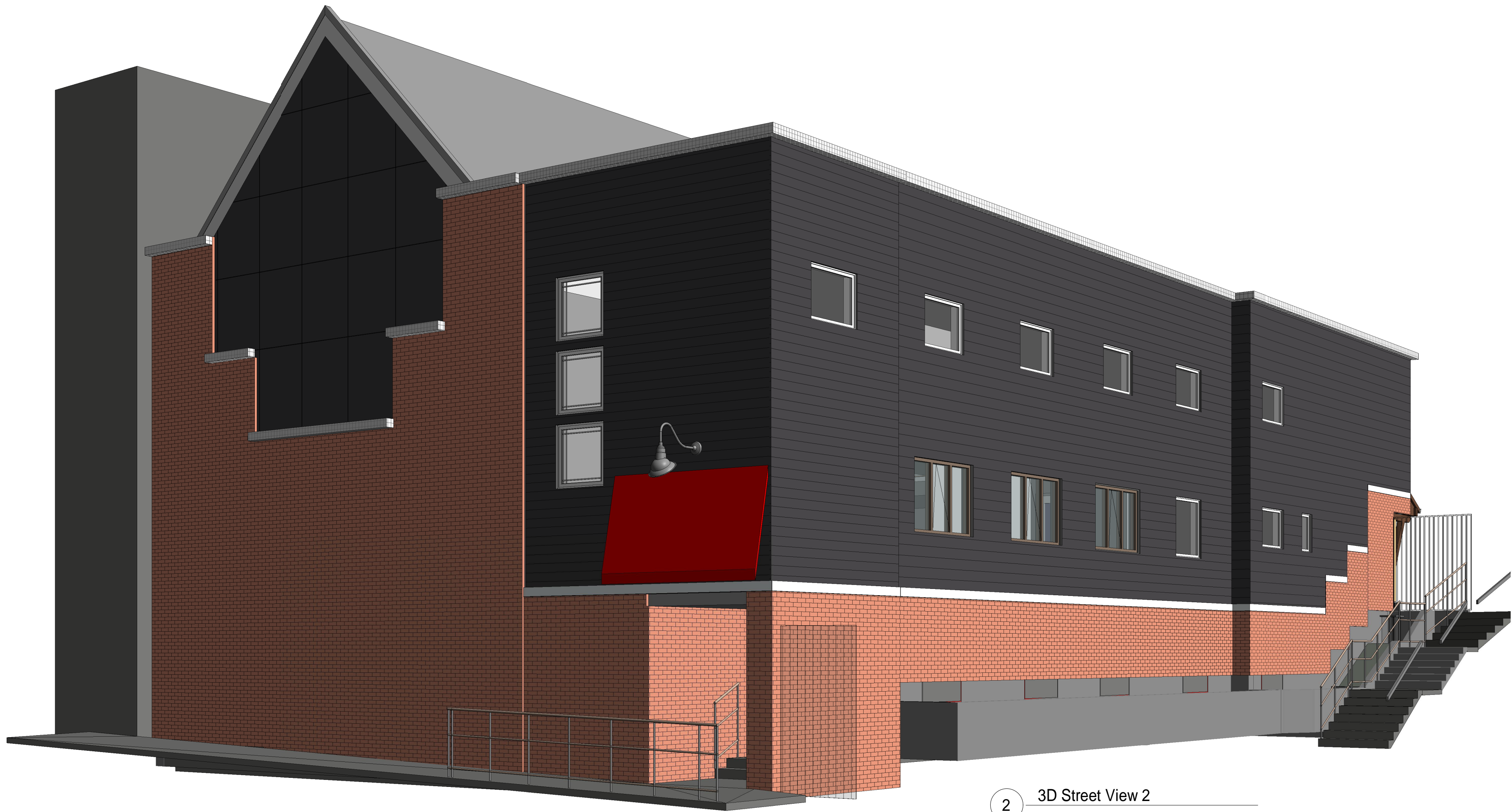
2 3D Street View 2 (STREET VIEW @ TRANS-CANADA HWY)