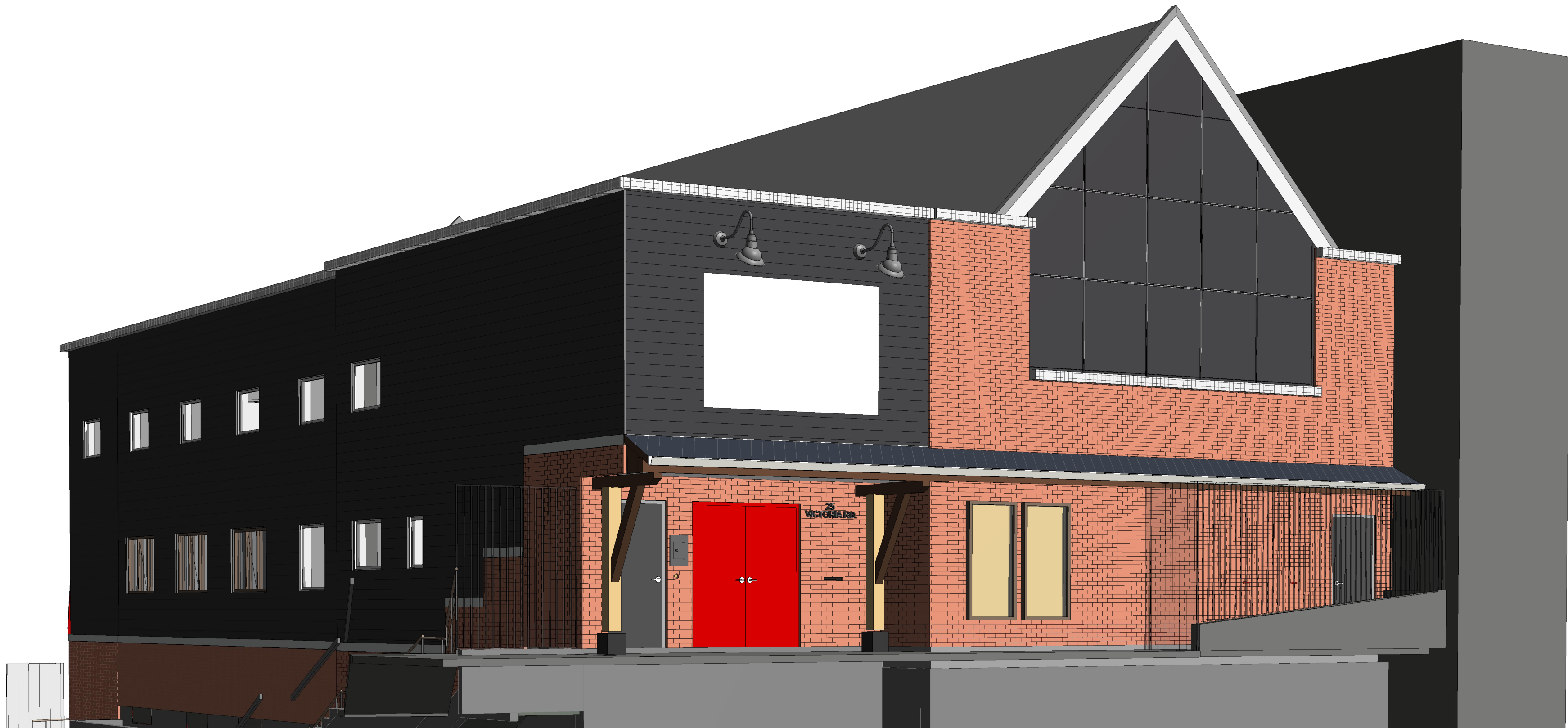
1 3D Street View 1 (STREET VIEW @ VICTORIA ROAD)