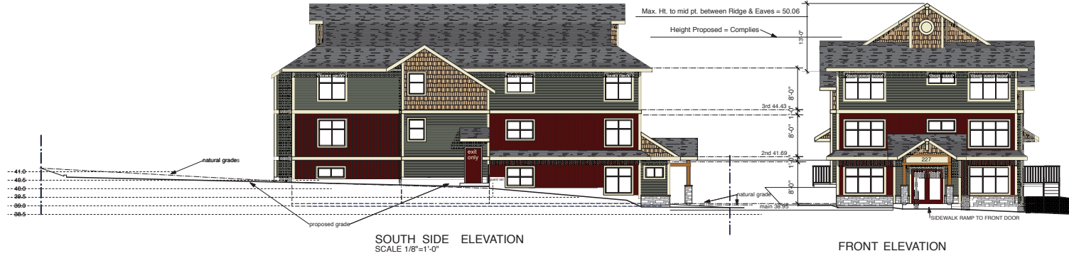
SOUTH SIDE ELEVATION SCALE 1/8"=1'-0"