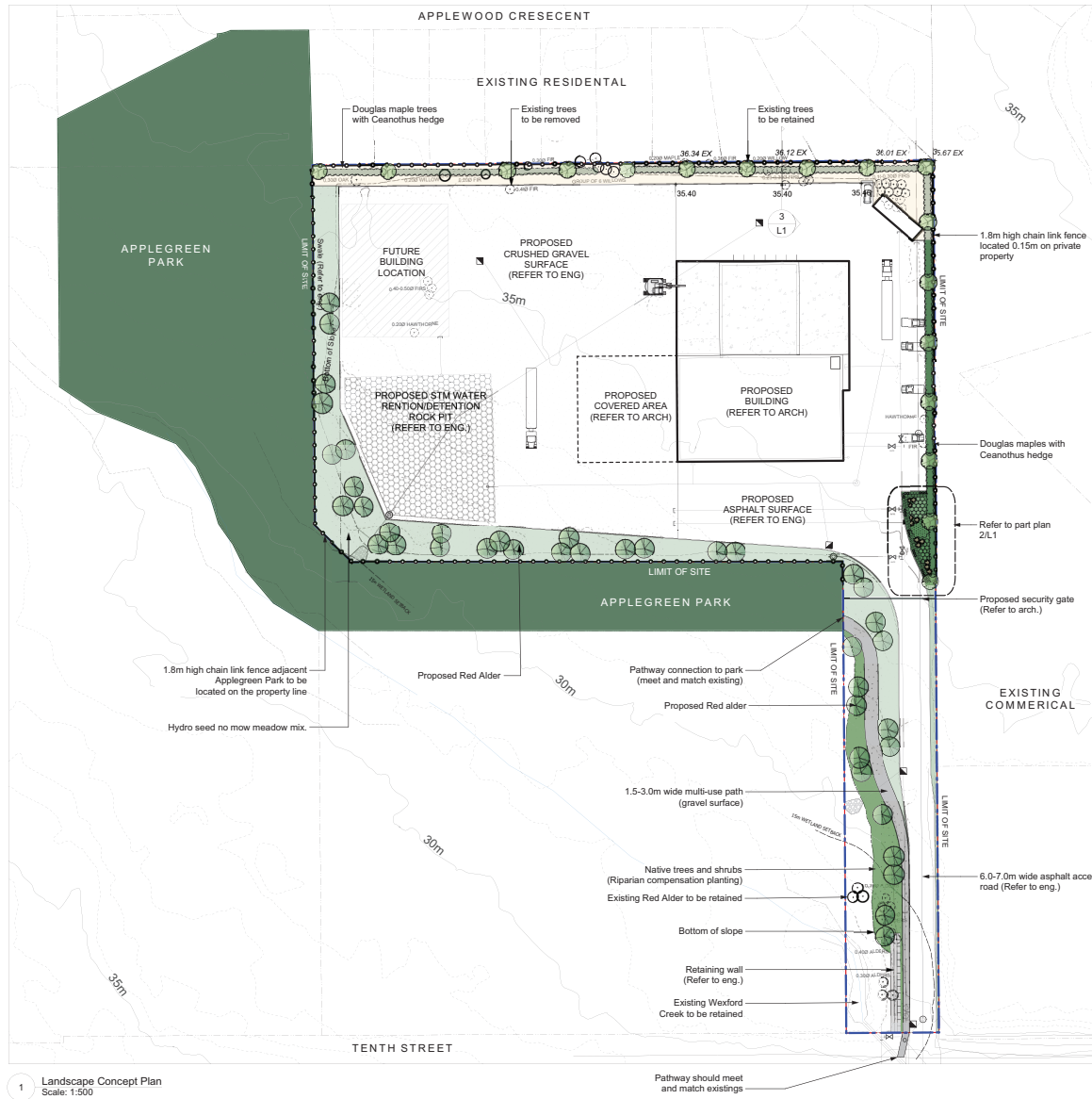
1 Landscape Concept Plan Scale: 1:500