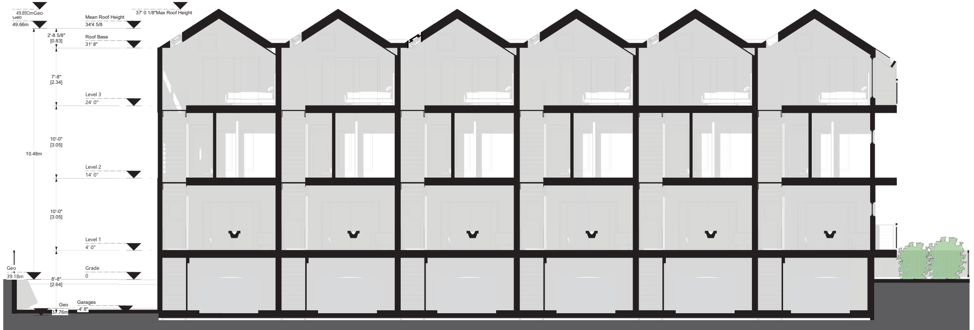
1 Section 1-1 Scale: 1/4" = 1'-0"