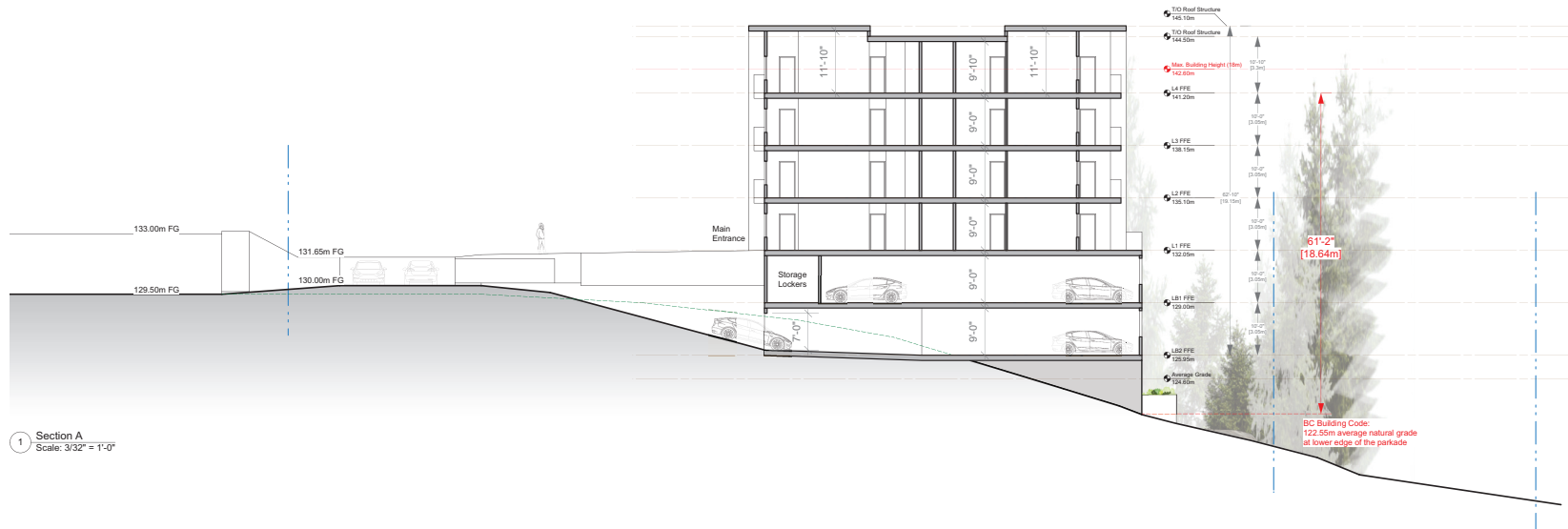
1 Section A Scale: 3/32" = 1'-0"