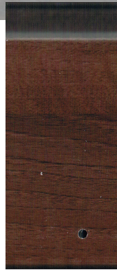
F3 - SAGIPER PVC SIDING "MOCHA REDWOOD"