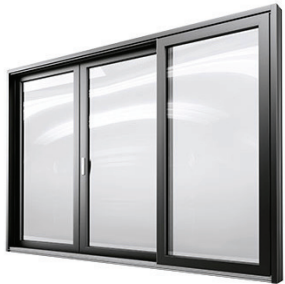
WESTECK - VINYL LIFT SLIDE