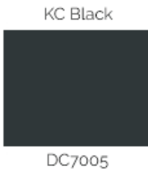
F1 - DC7005 - KC BLACK