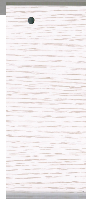
F4 - SAGIPER PVC SIDING/SOFFIT "WHITE OAK"

RECEIVED DP 1170 2020-JUN-17 COURTESY FINN ASSOC.