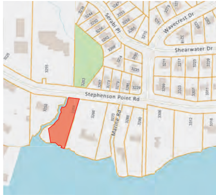
CONTEXT PLAN NTS

Streamside Protection Enhancement Area (6.9m setback from Top of Bank)