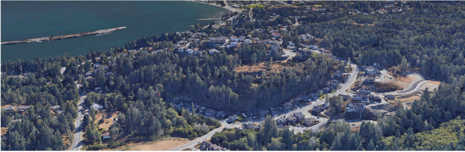
1 Hillside Aerial View not to scale