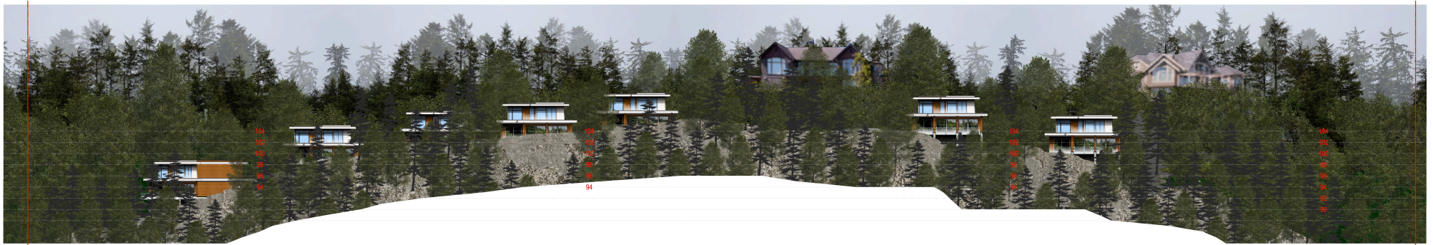
3 Orthographic Project Elevation

View of Single Detached Units stepped back from the Ridgeline.