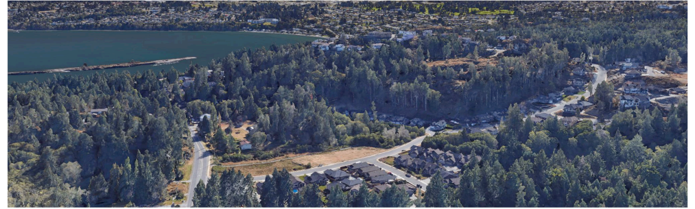
2 Hillside Aerial View not to scale