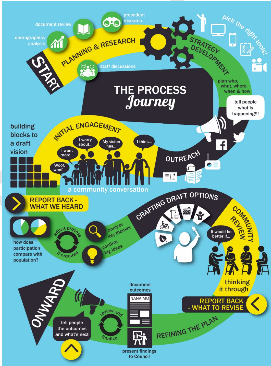
Figure 1: Illustration of the Nanaimo City Spark process journey

Our City, Our Voices. Let's spark a conversation in our community about our shared future. Developing a community vision for the next 20+ years requires a process that is grounded in a solid understanding of how our community has grown and advanced through strategic planning and creative thinking. Fundamental to this process is reflecting back "what we hear" and building forward towards best outcomes.