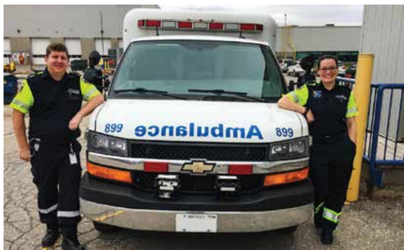
Paramedics are on the frontlines providing life-saving services including emergency and non-emergency pre-hospital care to residents.

When the time comes, municipalities will also be ready to lead Canada's recovery, along with our federal partners. Local leaders are already delivering frontline results for Canadians. And they are exceptionally well-placed to deliver stimulus funding quickly—to create jobs and get the economy going. Deepening the federal-municipal partnership even further will help Canada thrive and prosper once again.