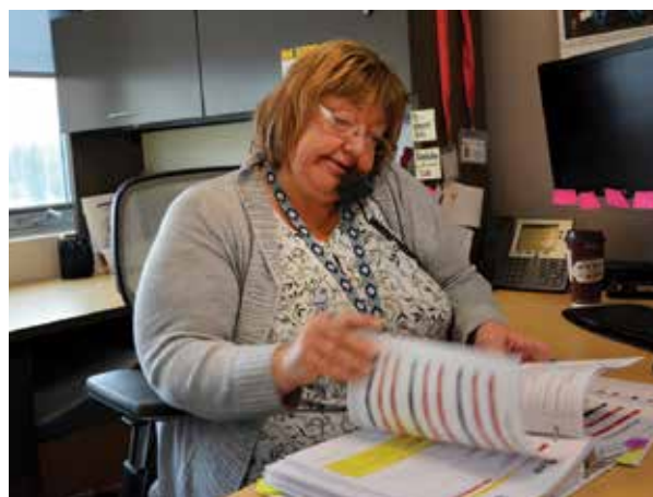
The Vulnerable Person's Registry is a critical program where the elderly and people with special needs are contacted daily, making sure that they are safe and their needs are being met.