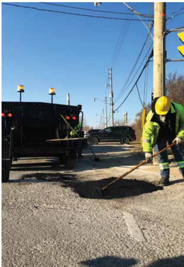
Municipal road maintenance staff are working around the clock to keep roads safe and accessible for those delivering essential services.