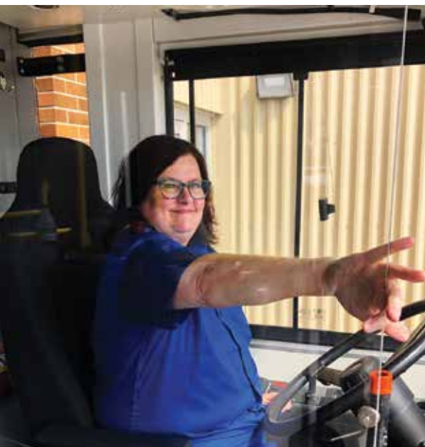
To keep drivers and riders safe, the City of Selkirk, MB, installed Plexiglas shields and closed off alternating rows inside the buses to encourage physical distancing.