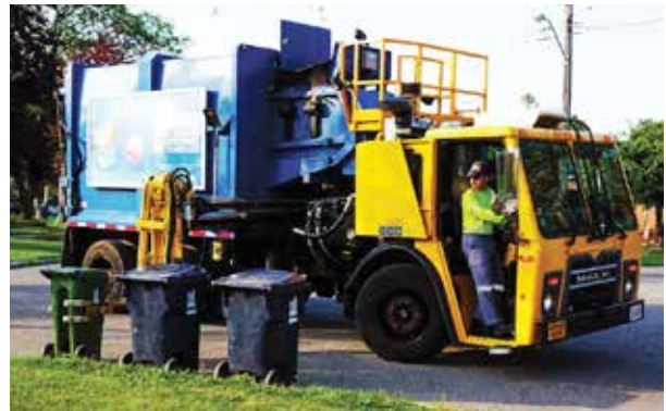
Municipal waste collection operators are keeping municipalities clean and green, while delivering essential services so residents can stay at home.

through the lives of Canadians. Insolvency is not an option. Bridge loans cannot address this crisis of permanent losses. Cutting essential services is not an acceptable option, not when Canadians need us most. This is why we are turning to our federal partners for emergency operating funding—to sustain municipal operations and essential services through these extraordinary times.