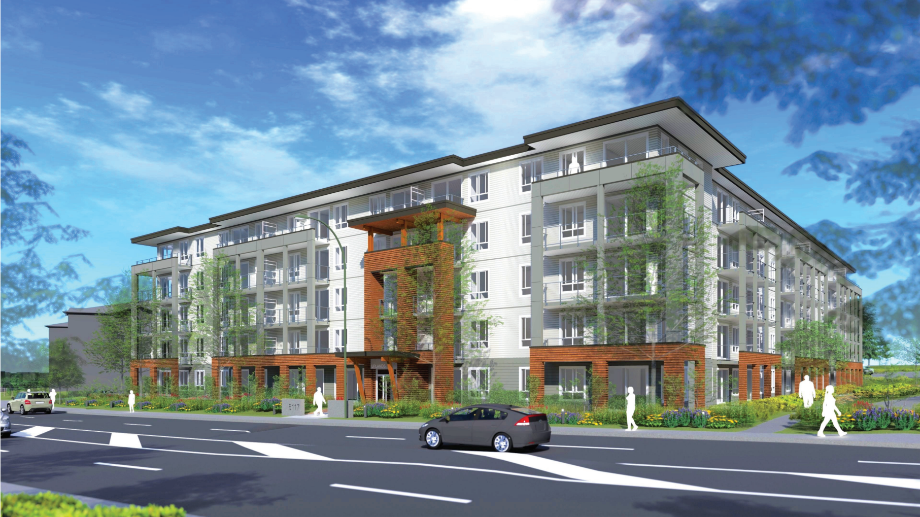
UPLANDS DRIVE LOOKING SOUTH

THIS ARTISTIC RENDERING IS CONCEPTUAL ONLY. IT IS NOT TO BE RELIED UPON AS A TRUE REPRESENTATION OF THE FINISHED PRODUCT.