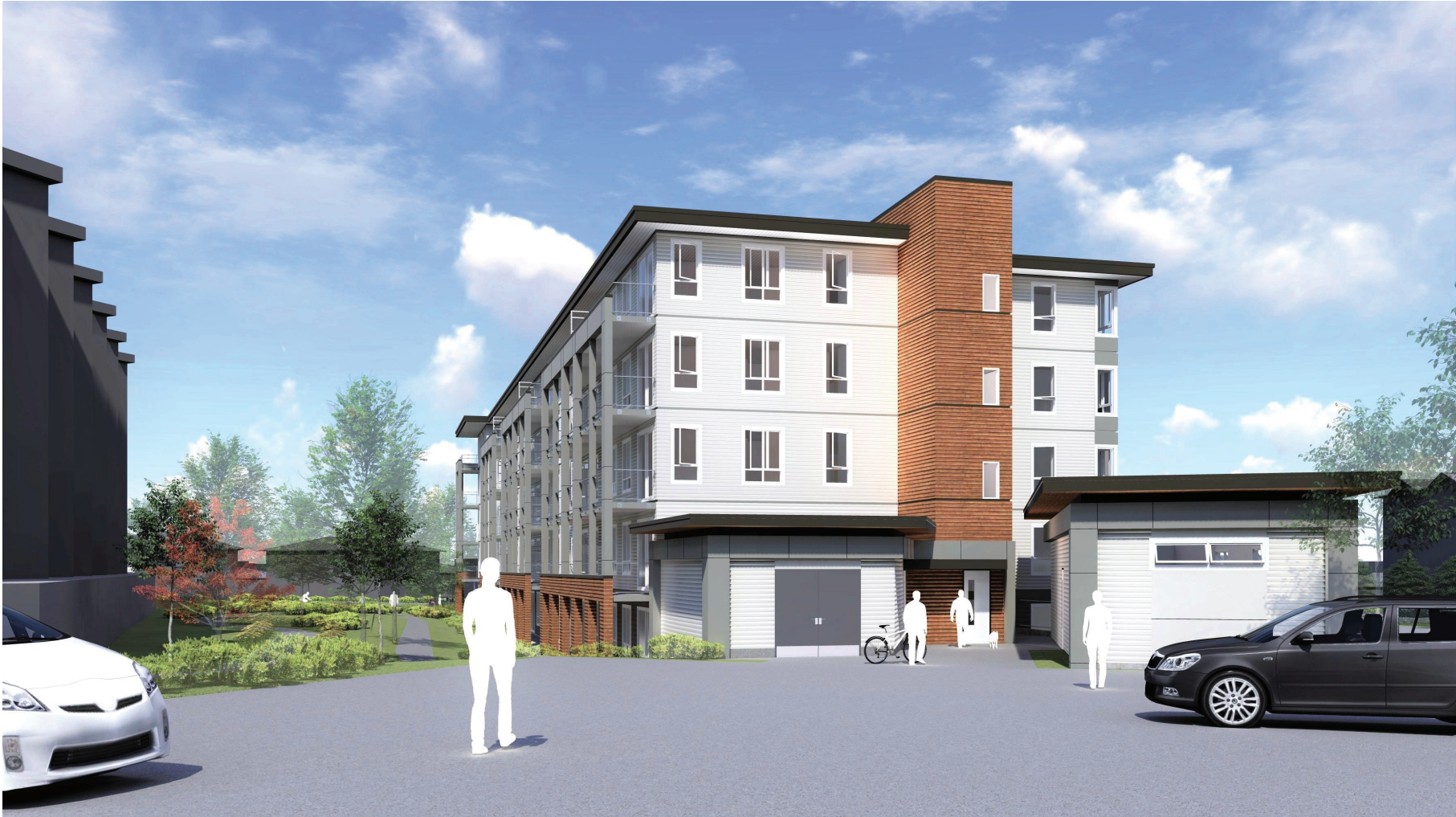
SENTINEL DR. LOOKING EAST

THIS ARTISTIC RENDERING IS CONCEPTUAL ONLY. IT IS NOT TO BE RELIED UPON AS A TRUE REPRESENTATION OF THE FINISHED PRODUCT.