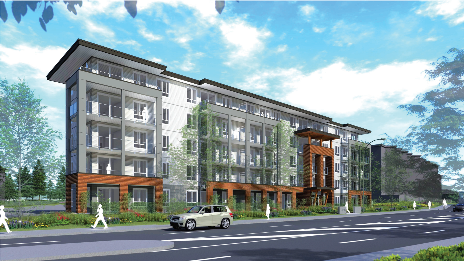
UPLANDS DRIVE LOOKING NORTH

THIS ARTISTIC RENDERING IS CONCEPTUAL ONLY. IT IS NOT TO BE RELIED UPON AS A TRUE REPRESENTATION OF THE FINISHED PRODUCT.