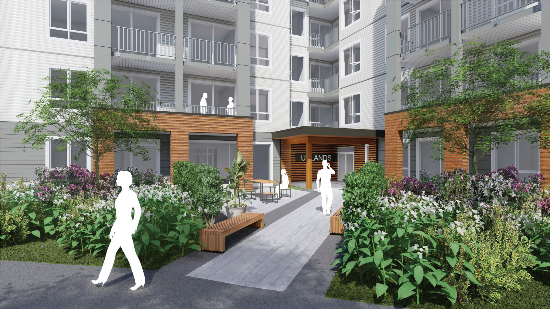
SOUTH ENTRY AND OUTDOOR AMENITY

THIS ARTISTIC RENDERING IS CONCEPTUAL ONLY. IT IS NOT TO BE RELIED UPON AS A TRUE REPRESENTATION OF THE FINISHED PRODUCT.