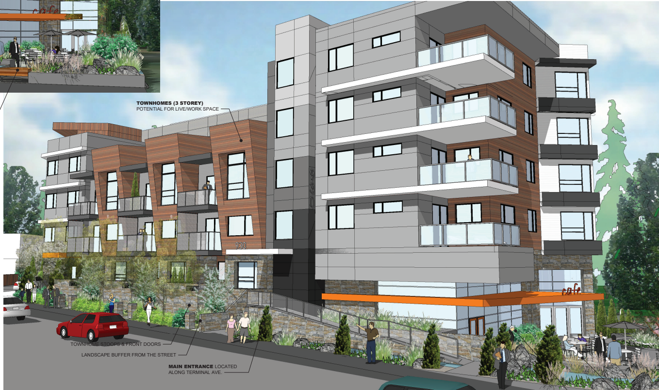
PERSPECTIVE ALONG TERMINAL

TOWNHOMES (3 STOREY) POTENTIAL FOR LIVE/WORK SPACE