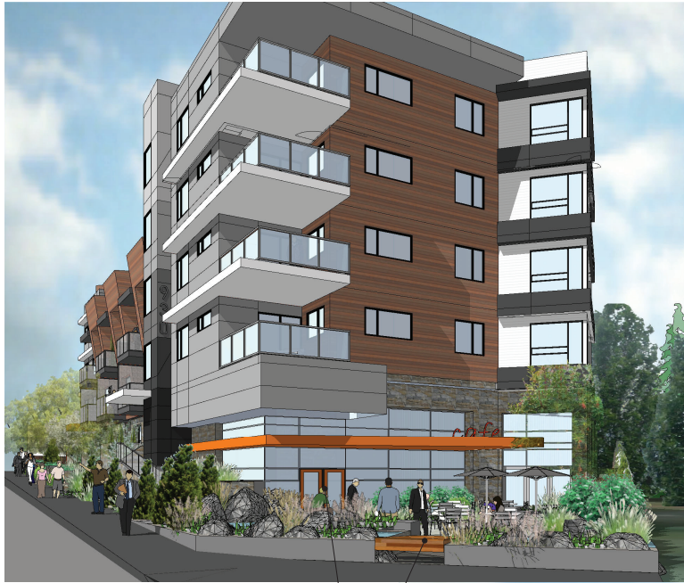
CORNER OF TERMINAL & CYPRESS

CAFE LOCATED AT CORNER OF TERMINAL & CYPRESS OUTDOOR SEATING AREA FOR CAFE