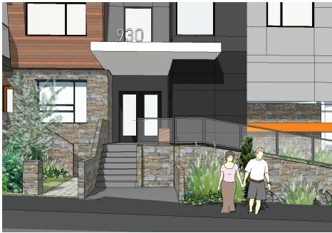
BUILDING ENTRANCE ALONG TERMINAL