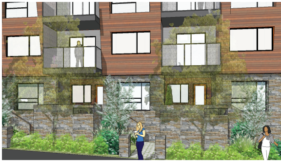
TOWNHOME ENTRIES ALONG TERMINAL