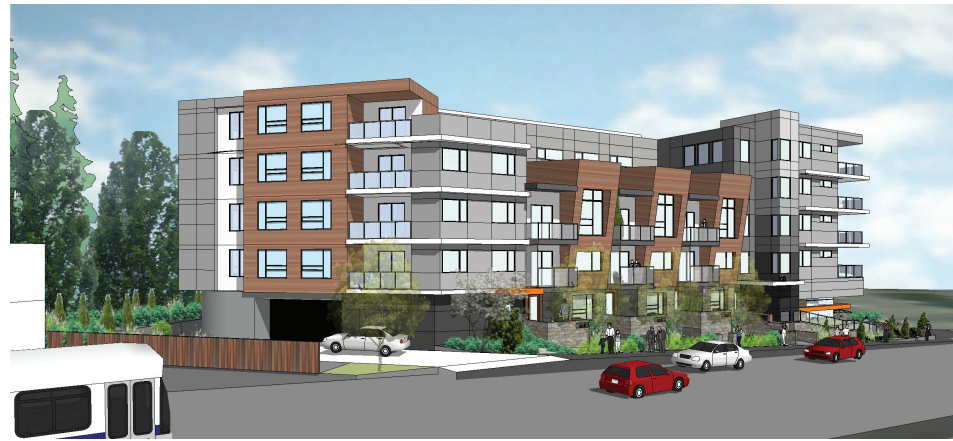
ELEVATION ALONG TERMINAL (FACING SOUTH EAST)

CAFE LOCATED AT CORNER OF TERMINAL & CYPRESS OUTDOOR SEATING AREA FOR CAFE