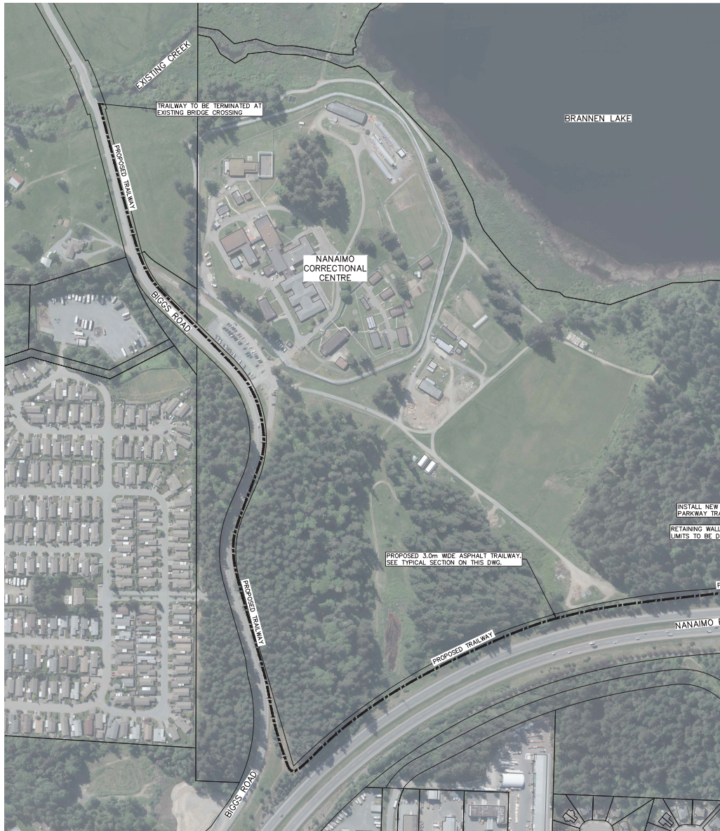
PROPOSED 3.0m TRAILWAY PLAN SCALE 1:2000