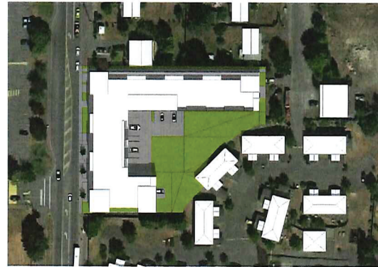
JUNE 21ST - 12PM