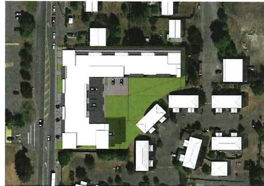
JUNE 21ST - 3PM

Copyright reserved. All parts of this drawing are the exclusive property of Wensley Architecture Ltd. All rights reserved. No part of this drawing may be reproduced, stored in a retrieval system, or transmitted in any form or by any means, electronic, mechanical, photocopying, recording, or by any information storage and retrieval system, without the prior written permission of Wensley Architecture Ltd. All dimensions shall be verified by the Contractor before commencing work.