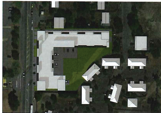
DECEMBER 22ND - 3PM

Copyright reserved. All parts of this drawing are the exclusive property of Wensley Architecture Ltd. and shall not be used without the explicit permission. All dimensions shall be verified by the Contractor before commencing work.