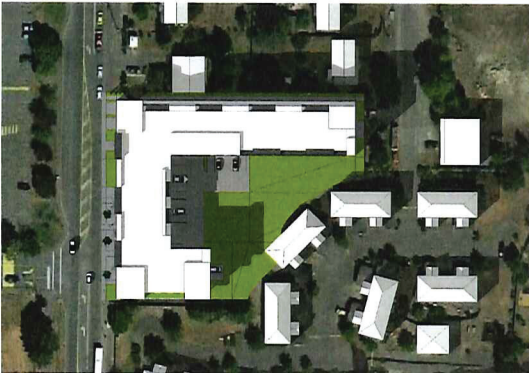
MARCH 20TH - 3PM