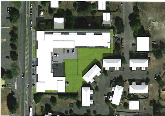
SEPTEMBER 22ND - 12PM