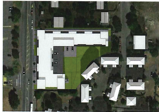
DECEMBER 22ND - 12PM