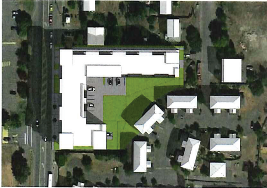
SEPTEMBER 22ND - 9AM