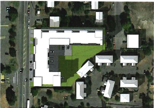
SEPTEMBER 22ND - 3PM