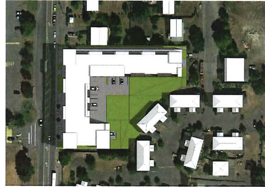
JUNE 21ST - 9AM