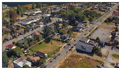
4 South-East Aerial Photo Scale: N.T.S.