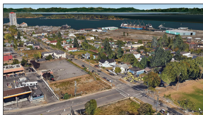
2 North-East Aerial Photo Scale: N.T.S.