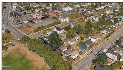
3 North-West Aerial Photo Scale: N.T.S.