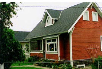
Name: Craig Street Residence Location: 112 Craig Street Date: Circa 1912

Located on a high rocky outcrop in a municipal park, the building is a highly visible symbol of the scouting movement in Nanaimo and, by extension, the continuing importance of local organizations to the vitality and richness of community life.