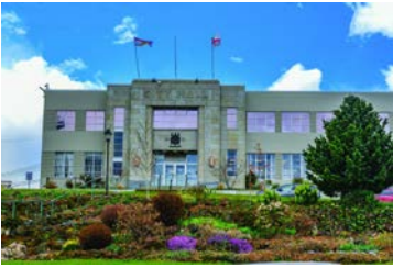
Name: Nanaimo City Hall Location: 455 Wallace Street Date: 1950-1951

From incorporation in 1874 to the completion of this building in 1951, civic business was conducted from a succession of inferior buildings inherited from other organizations. The purpose-built City Hall represents the maturation and modernization of the municipal government and, by extension, the City as a whole.