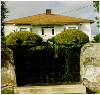
Name: Gilbert Residence Location: 279 Selby Street Date: 1893