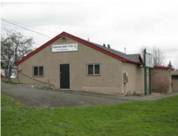
Name: Connaught Barracks Stable Location: 850 Wentworth Street Date: Circa 1915