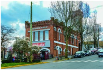
Name: Nanaimo Firehall #2 Location: 34 Nicol Street Date: 1893

The Residence's waterfront location, exceptional condition and its unusual style make it a highly prominent landmark.