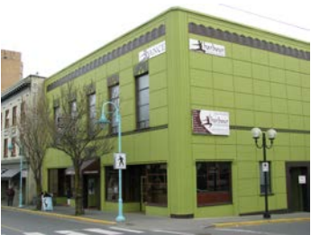
Name: Eagle's Hall Location: 133-41 Bastion Street Date: 1934

Designed by architects Breseman and Durfee, who also designed Victoria's First Congregational Church and St. James Hotel, the Commercial Hotel is a very good example of the Edwardian Commercial style and features the simplicity and overall restrained appearance typical of this style. Despite some alterations, much of the building's original character is intact, including the brick facing, projecting metal cornices and storefront piers.