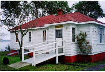
Name: Gallows Point Lighthouse Keeper's Cottage Location: 208 Colville Trail Date: Circa 1912

In 1852 a Hudson's Bay Company shepherd was murdered near Saanich, and outraged Governor James Douglas was determined that law and order would prevail in the new colony. He dispatched a ship from Victoria to apprehend the two native suspects, one of whom was from Cowichan and the other the son of a chief from Nanaimo. They refused to surrender, however, and two more ships were dispatched to the area. After they were apprehended, they were tried on the quarterdeck of the S.S. Beaver on January 17, 1853, and hung the same afternoon, the first trial by judge and jury under English law on the Coast. The site of the hanging was originally called Execution Point, but subsequently became known as Gallows Point.