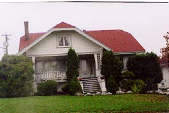
Name: Van Houten Residence Location: 184 Mount Benson Street Date: 1924

The Galbraith Residence is part of a significant grouping of heritage buildings in this neighbourhood.