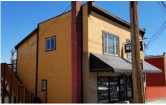
Name: Central Dairy Location: 428 Fitzwilliam Street Date: 1929