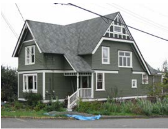
Name: "Fernville" (The Land Residence) Location: 167 Irwin Street Date: Circa 1890

Built around 1890, Fernville is a very good example of a picturesque Late Victorian building. Tall and imposing in massing, the house features a cross-gabled roof. The ground floor is clad in drop siding; the second floor in bellcast shingling. The corner entry porch is supported on a single, turned column. Coloured glass insets exist in the corners of some of the windows.