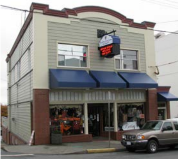
Name: Adirim's Junk Store (now the Zorkin Building) Location: 418 Fitzwilliam Street Date: 1931

The building, an integral part of the Fitzwilliam Street corridor, is part of a grouping of historic buildings located in this neighbourhood.