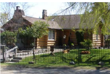
Name: Williams Residence Location: 40 Thetis Place Date: Circa 1938

The residence is a tangible reminder of this neighbourhood's earlier character as an upscale, semi-rural, residential neighbourhood. When built, the house was part of a grouping of prestigious homes that lined this section of the road. By the late 1960s, the neighbourhood was becoming increasingly commercial and the area lost much of its previous exclusive residential status.