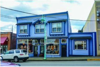
Name: T&B Apartments Location: 413-417 Fitzwilliam Street Date: 1920

The Mitchell's Market building is part of a substantial grouping of heritage buildings in this area.