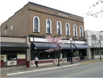
Name: Davidson Block (later the Queen's Hotel) Location: 34 Victoria Crescent Date: 1892

Built in 1892, the Queen's Hotel is a good, rare surviving example of the Italianate style, one of the most popular architectural styles of the nineteenth century. Although the hotel was substantially renovated in the 1980s and many of the original architectural elements were lost, the essential form and mass of the building are intact.