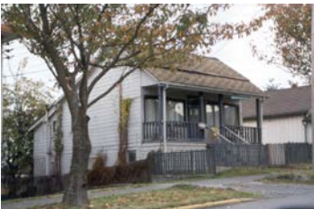
Name: Haliburton Street Miners' Cottage Location: 111 Haliburton Street Date: Circa 1875

Although the house has been renovated and now features a new roof, modern siding and a small porch at the rear, it remains a good example of early, vernacular worker's housing typical of this Nanaimo neighbourhood.