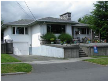
Name: Hitchen Residence Location: 395 Machleary Street Date: 1952

Built in 1952, the Hitchen Residence is a very good example of early ranch house design and displays many elements typical of the style including a long and low profile, rock trim on the exterior, a low-pitched roof, large picture windows and deeply overhanging eaves. The street-facing porch, so popular in earlier bungalows, is replaced here by a discreet entryway and street facing garage, another typical Ranch style element. Inside, the original highly coloured bathroom tiles and fixtures, airy living areas and intact kitchen are delightful reminders of the “modern” decade.