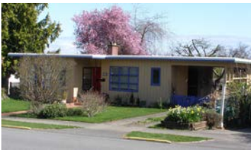
Name: Cunningham Residence Location: 190 Kennedy Street Date: Circa 1961

Located opposite Gyro Park, the building is part of a significant concentration of heritage buildings located in one of the City's oldest neighbourhoods, immediately adjacent to the downtown core.