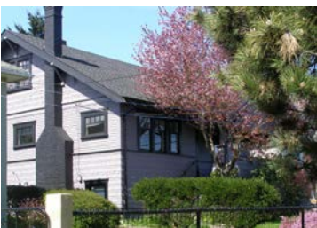
Name: Stephens' Residence Location: 505 Stewart Avenue Date: Circa 1921

Due to its corner lot location, Hoggan's Store has a prominent street presence and is a highly visible neighbourhood landmark.