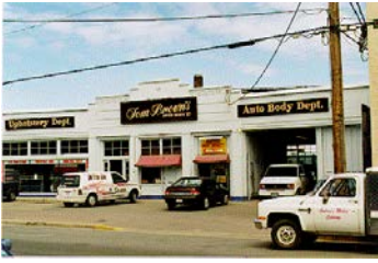
Name: Tom Brown's Auto Body Location: 28 Front Street Date: 1937

Tom Brown's Autobody is significant as an example of the type of building that once formed the main automotive sales and service district in Nanaimo. From the mid-1920s to the early 1960s, this section of downtown included numerous service stations, automotive parts businesses and car showrooms. In the early 1960s, automobile-related businesses were among the first to relocate to areas outside the downtown core. This exodus was part of a broader trend of commercial relocation away from the city centre and to outlying suburban areas. The building continues to house an automobile-related business.