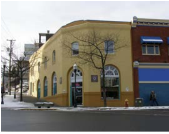
Name: Merchant's Bank of Canada Location: 499 Wallace Street Date: 1912

Built in 1912, the Merchant's Bank is Nanaimo's sole example of the eclectic, elegant Free Renaissance style, inspired by Italian churches and palaces, and popular in North America from the late 19th to early 20th centuries. The exterior was faced with a combination of a banded brick base and quoining that framed the edges and structural openings. A later coat of stucco obscured these features but some of the facade details, including the prominent cornices typical of this style, are still discernible. The elaborately detailed, round-arched windows, featuring radiating mullions and brick keystones, angled corner entry and ornate cast plaster ceiling are also substantially intact.