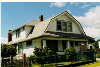
Name: Western Fuel Company House #24 Location: 715 Farquhar Street Date: Pre-1908 (rebuilt 1916)

The building is located amidst mature vegetation on a large lot in a compatible rural use area, and is prominently viewed from both Extension Road and the abutting Chase River School.