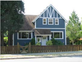
Name: Ivers/Honey Residence Location: 911 Wentworth Street Date: Circa 1939

Built around 1939, the Ivers/Honey Residence is a very good example of a vernacular, English-Cottage style building. Although there have been some changes to the exterior over time, most notably the stucco cladding and replacement windows and doors, the basic form and integrity of the building remains intact.