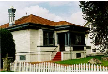
Name: Schetky Residence Location: 225 Vancouver Avenue Date: 1898

Built around 1898 for G.L. Schetky, an insurance agent and U.S. Consul, the Schetky Residence is an excellent example of a transitional Late Victoria/Edwardian style bungalow. The square-plan house has a central front entry with square chamfered columns, and a bellcast pyramidal roof. The long, low proportions mark the change in style at the end of the Victorian era, when tall, asymmetrical houses with highly decorated surfaces and complex roof lines went out of fashion. The ornamentation is limited to scroll-cut eave brackets, banded and corbelled chimneys, and a rear window flashed with coloured glass.