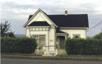
Name: Victoria Road Residence Location: 413 Victoria Road Date: Circa 1892

Prominently located on a busy thoroughfare at the corner of Victoria Road and Farquhar Street the residence is a highly visible landmark. The building is located in an established neighbourhood surrounded by mature, sympathetic landscaping .