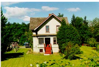
Name: Oikari Residence Location: 1343 Quinn Lane Date: Circa 1912

The Jones Residence is a rare surviving example of the type of superior housing that predominated in this area, known as Nob Hill, from its first development around 1870 until around 1910. Here, the city's commercial and professional elite built substantial homes. By the early 19th century, Nanaimo's middle-classes were relocating to areas further north and west, away from the city centre. Today, the neighbourhood is a mix of apartment buildings, boarding houses and single-family houses and has lost much of its upscale character but surviving early residences such as this building testify to the original nature of the area.