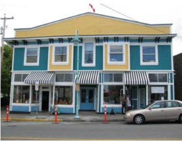
Name: S&W Apartments Location: 403-409 Fitzwilliam Street Date: 1910

The manse, rock wall, landscaped grounds and attached hall all have a historic and physical relationship to the church and are an essential part of the site's value. The church's tall bell tower and substantial mass dominate this corner of Fitzwilliam Street and make the building a highly visible historic landmark.