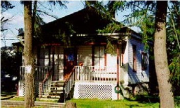
Name: Meredith Road Residence Location: 2126 Meredith Road Date: Circa 1900

This tall Late Victorian house displays the influence of the Italianate style. Scroll-cut eave brackets decorate the broad cornice under the roofline. A two storey projecting front semi-octagonal bay features star-shaped cut-outs, and a steeply-sloped skirting that extends to form a roof over the front entry. Slender turned columns frame the front door. The front door and the balustrade have been replaced, and a deck added to the rear of the house, otherwise it remains in very good condition. Joseph Rowley, the first owner, was a blacksmith.