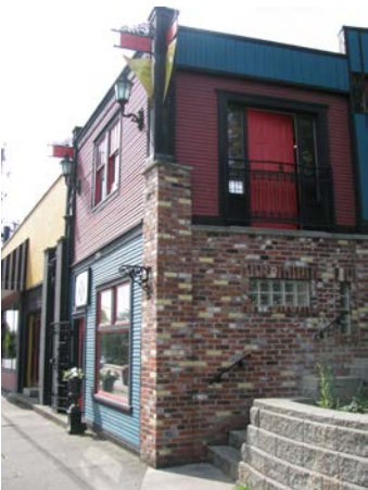
Name: Willard Service Station Location: 291 Wallace Street Date: Circa 1910

The residence was built for the Gulliford family, who operated a florist business downtown. A large greenhouse (now demolished) that serviced the florist business was built adjacent to the house.