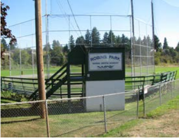
Name: Robins' Park Location: 620 Park Avenue Date: 1903-1904