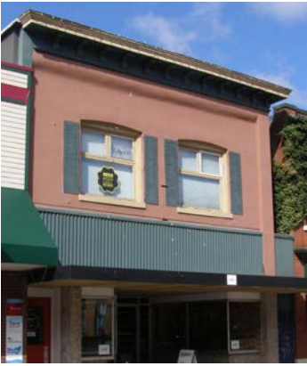
Name: Caldwell Block Location: 35 Commercial Street Date: Circa 1908

Built in 1908, the Caldwell Block is a good example of a modest, vernacular Edwardian style commercial building. The original brick façade is obscured by stucco but some of its features, including a cornice with brackets and moulded fascia, are still visible. Traces of the painted Caldwell's Clothing House sign, which occupied the building from at least 1920 until the late 1930s, are visible on the building's east side. Despite alterations, the building has maintained its character and reinforces the Edwardian era appearance of the west side of Commercial Street.