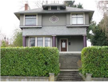
Name: Woodman Residence Location: 307 Kennedy Street Date: 1913

The residence speaks to the area's growth, after the turn of the 20th century, as a middle to upper income residential neighbourhood, a comfortable distance from the busy commercial core and adjacent mixed-use neighbourhoods.