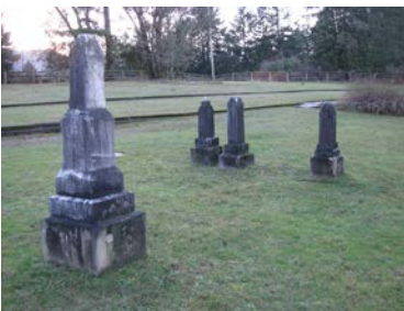
Name: Wellington Cemetery Location: 4700 Ledgerwood Road Date: 1890s or earlier

Known informally as Piper Park for many years, the site was not officially designated a park and named Piper Park until 1980. By this time, the Nanaimo Centennial Museum had been built and historical buildings and artefacts (such as the No. 19 Steam Locomotive) moved to the site. Piper Park is located on a prominent rock outcrop within the City's downtown core. The Park is composed of mature vegetation and a series of buildings and artefacts including the old Centennial Museum building, the Miner's Cottage, a Steam Locomotive, and numerous other smaller pieces.