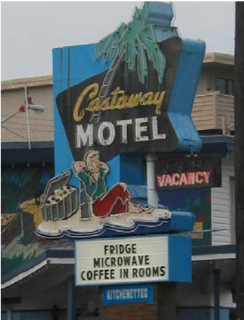
Name: Castaway Motel Neon Sign Location: 205 Terminal Avenue N. Date: Circa 1940s