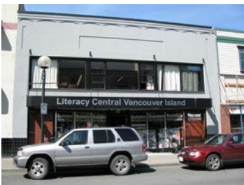
Name: Nash Hardware Location: 19 Commercial Street Date: 1909

The Gallows Point Light Keeper's Cottage is an excellent example of the adaptive re-use of a historic resource. This building and another residence built in 1938 were abandoned about 1980 when the lighthouse was automated. The two-acre site is now owned by the municipality and leased to a local service group who make the building available for special events.