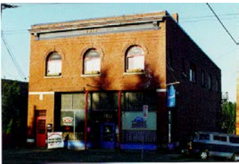
Name: Hoggan's Store Location: 404 Stewart Avenue Date: 1914

Prominently located at the corner of Stewart Avenue and Mt. Benson Street, this residence formed part of a larger concentration of heritage buildings comprising the Newcastle Townsite and is a highly visible neighbourhood landmark. The building is surrounded by mature, sympathetic landscaping which features a row of mature Copper Beech trees located on the adjoining Mt. Benson Street right-of-way.