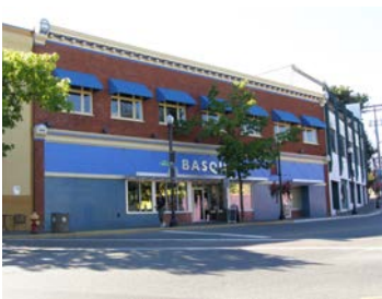
Name: Brumpton Block Location: 481-489 Wallace Street Date: 1912

The gardens at the side and front of City Hall were designed at the same time as the building and are integral parts of the site's value. Situated on a high rocky outcropping, the extensively landscaped grounds soften the rigid formality of the building's architecture. The winding roadway that leads to the front entry provides a welcoming entrance, appropriate to a public building.