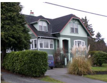
Name: Granby Mine Residence Location: 523 Vancouver Avenue Date: Circa 1918 (relocated circa 1935)

The Bird House is a rare surviving example of the type of prestigious housing that predominated in Newcastle Townsite from its first development just after 1900 until the 1940s. Separated from the rest of Nanaimo by the Millstone River, Newcastle Townsite quickly became an exclusive residential suburb for the city's commercial and professional elite. Today, the neighbourhood is a mix of commercial buildings, apartment buildings and single-family housing but surviving early residences such as this building are important evidence of the original character of the area.