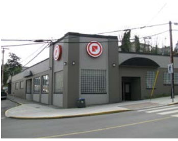
Name: Provincial Liquor Store Location: 25 Cavan Street Date: 1949

The Provincial Liquor Store is a very good example of Streamline Modern architecture. Built of cast-in-place concrete, this horizontally proportioned building is minimally detailed. Glass block, a typical feature of this style, was used for the windows and curved entry walls.