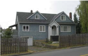
Name: Gulliford Residence Location: 285 Wall Street Date: 1937

Frederick Crewe, a miner, is listed as living at this site in Five Acres as early as 1900, and it is likely that this house dates from approximately that time. This simple rectangular structure has an inset corner porch, and a full open front verandah that faces the rear lane. This is possibly the oldest surviving house in the Five Acres area, and has been maintained in good condition. A concrete milk house remains on the Wakesiah Avenue side of the property, and the concrete foundations of a barn exist on the adjacent lot to the south, recalling the agricultural legacy of the area.