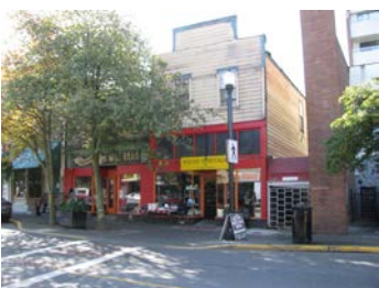
Name: Victoria Crescent Commercial Building Location: 33-35 Victoria Crescent Date: Circa 1892 or earlier