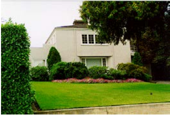
Name: Westwood / Giovando Residence Location: 225 Newcastle Avenue Date: Circa 1940

The design of this modernistic house is balanced through the use of single storey wings to each side of a two storey block with a hip roof. A curved second floor balcony with pipe railings covers the inset front entry. The living room window is inset with curved reveals. The site has been beautifully landscaped to complement the house, including planted flower beds, a gracious front lawn, and a large mature cedar tree.