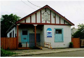
Name: Provincial Government Mine Rescue Station Location: 1009 Farquhar Street Date: 1913

Built in 1913, the Provincial Government Mine Rescue Station is a good example of a vernacular, utilitarian building and one of the oldest known local uses of corrugated iron cladding.