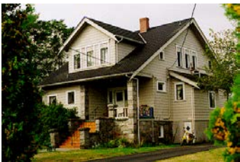
Name: Pine Street Residence Location: 259 Pine Street Date: Circa 1913

The building is located on a busy thoroughfare in one of the City's oldest neighbourhoods, immediately adjacent to the downtown core, and surrounded by mature, sympathetic landscaping.