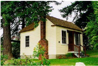
Name: Rowbottom Residence (now "The Miner's Cottage") Location: 100 Cameron Road Date: Circa 1897

The Nanaimo Centennial Museum is located on a prominent rock outcrop within the City's downtown core. Set in a municipal park that includes a miner's cottage and other mining-related artefacts, the Museum building is part of an integrated coal mining education and interpretive site.