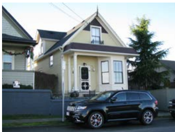
Name: Smith/Wilson Residence Location: 12 Irwin Street Date: Circa 1889

Located near the Bowen Road Cemetery, the residential property forms part of the historical Fairview neighbourhood, and is believed to be one of the oldest residences in this area. The residence forms part of a grouping of similar era housing with mature landscaping along this portion of Howard Avenue, distinctly contrasting with the post-modern era housing stock located directly across the street.