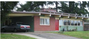
Name: McCannel Residence Location: 757 Northumberland Avenue Date: Circa 1950

The Northfield School's height, mass and location on a main thoroughfare make it an important neighbourhood landmark.