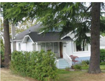
Name: Steel Residence Location: 990 Campbell Street Date: 1936

The only building of its type that is open to the public, the Miner's Cottage has significant educational value as an example of the living arrangements and lifestyles of 19th century British Columbian industrial workers. Set in a municipal park that includes a regional museum and other mining-related artifacts, the cottage is part of an integrated coal mining education and interpretive program.