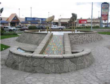
Name: Italian Centennial Fountain Location: 626 Terminal Avenue Date: 1959-1961

Manufactured in the 1940s and installed when the motel was built in 1956, the Castaway Motel neon sign is the only remaining original signage on what was Nanaimo's first motel "strip". Developed in response to the post-war enthusiasm for automobile vacations, Nanaimo's motel strip included motels and auto courts which, unlike earlier hotels, were specifically designed to provide ample automobile parking. Although the "strip" still includes a number of motels, only the Castaway Motel retained its original signage.