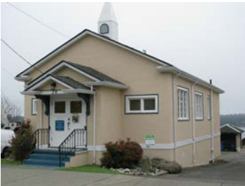
Name: Christian Science Society Building Location: 20 Chapel Street Date: 1932

The Provincial Liquor Store is evidence of Nanaimo's post Second World War economic renewal and represents, in its striking modernity, a shift towards a different aesthetic in the downtown core.