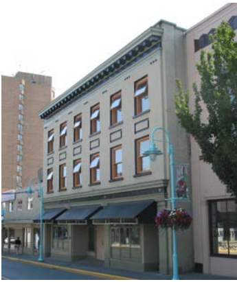
Name: Commercial Hotel Location: 121 Bastion Street Date: 1913

The Commercial Hotel is a tangible reminder of the social and economic importance of hotels in Nanaimo history. Like most mining communities, early Nanaimo had a large population of single, often transient men. As affordable housing alternatives, hotels functioned as living quarters and, in the saloons and restaurants typically located on the ground floor, as social centres.