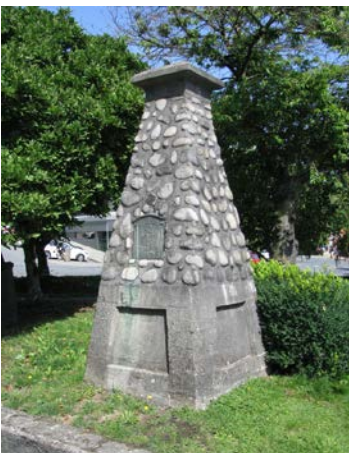
Name: Pioneer Square/Little Bastion Location: 28 Nicol Street