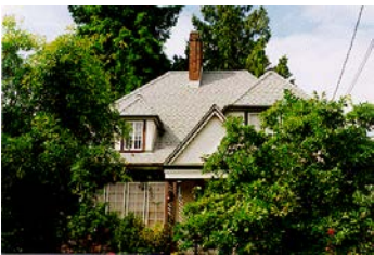
Name: Ekins Residence Location: 441 Vancouver Avenue Date: 1927