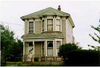
Name: Rowley Residence Location: 426 Machleary Street Date: 1893

This tall Late Victorian house displays the influence of the Italianate style. Scroll-cut eave brackets decorate the broad cornice under the roofline. A two storey projecting front semi-octagonal bay features star-shaped cut-outs, and a steeply-sloped skirting that extends to form a roof over the front entry. Slender turned columns frame the front door. The front door and the balustrade have been replaced, and a deck added to the rear of the house, otherwise it remains in very good condition. Joseph Rowley, the first owner, was a blacksmith.