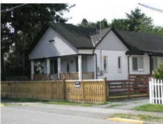
Name: Manson Residence Location: 471 Selby Street Date: 1885-1887

Built by the Canadian Pacific Railway Company in 1920, the Nanaimo Station, which replaced the earlier building, exemplifies the form of station built in mid-sized communities across Canada in the early 20th century and can be seen as an early example of corporate branding that visually tied Nanaimo to the rest of the CPR empire. The Nanaimo station appears to be a more elaborate version of CPR Standard Plan No. 9, a "combination station" that included living quarters and commercial space. The station house's most distinctive feature is its central square tower. In addition to providing an attractive visual element, the tower's projecting bay served a useful function by giving an unobstructed view of the track. Although there have been some changes to the building over time, including a comprehensive rehabilitation and roof reconstruction in 2012, it remains substantially intact.