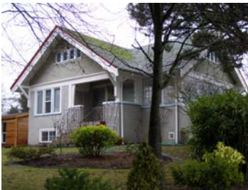
Name: Wells Residence Location: 904 Wentworth Street Date: 1911

The building is located within a popular park at the intersection of Machleary and Wentworth Streets.