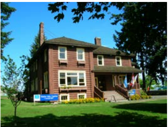
Name: Beban House Location: 2290 Bowen Road Date: 1930

The cast concrete eagle sculpture over the front entry is a tangible reminder of the Eagle's long association with the building and of the importance of fraternal organizations in the cultural, economic and social life of the city. Before the institution of Medicare and government pensions, organizations like the Eagle's provided medical and other benefits to their members. In coal mining communities like Nanaimo where accident and death rates were exceptionally high, such benefits were crucially important.