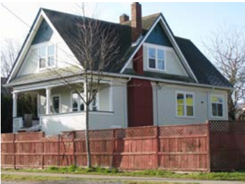
Name: Booth Residence Location: 302 Victoria Road Date: Circa 1913