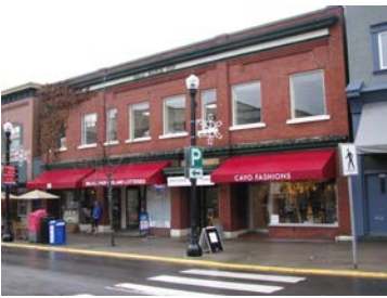
Name: Hall Block Location: 37-45 Commercial Street Date: 1925

Built in 1908, the Caldwell Block is a good example of a modest, vernacular Edwardian style commercial building. The original brick façade is obscured by stucco but some of its features, including a cornice with brackets and moulded fascia, are still visible. Traces of the painted Caldwell's Clothing House sign, which occupied the building from at least 1920 until the late 1930s, are visible on the building's east side. Despite alterations, the building has maintained its character and reinforces the Edwardian era appearance of the west side of Commercial Street.