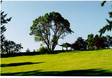
Name: Chinese Cemetery Location: 1598 Townsite Road Date: 1924

The Chinese Cemetery is a rare, tangible link with Nanaimo's Chinese heritage. The Chinese, almost wholly single men, came to Nanaimo as early as the 1860s to work in the mines or to open businesses. Perceived as unfair competition because of their willingness to work for lower wages than white employees, the Chinese were the source of much labour conflict during the 19th century. Initially, the Chinese settled in what is now downtown Nanaimo but in the 1880s, they were removed, by the coal company, to the outskirts of town in an effort to reduce tensions. By 1908, a new Chinatown, one of the largest in North America at that time, was established near the western edge of the city. This last Chinatown was destroyed by fire in 1960, although much of its population had already dispersed. Because there is so little other tangible evidence of Nanaimo's Chinese heritage, the Chinese Cemetery is especially significant.