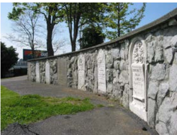
Name: Pioneer Cemetery Park Location: 10 Wallace Street Date: circa 1853

Built in 1924, the Chinese Cemetery is a very good example of an ethnic cultural landscape. In addition to grave markers with Chinese inscriptions, the cemetery features traditional Chinese elements including ornate, brightly painted entry gates, a pagoda structure, an altar and a shrine. Although the cemetery is no longer exclusively Chinese, it retains, through the presence of these elements, a distinct Chinese character. The Cemeteries' striking entrance gates and its location on a main thoroughfare make it a highly visible neighbourhood landmark.