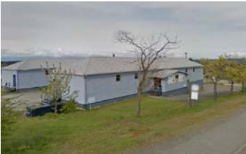
Name: Nanaimo Military Camp (Building #613) Location: 750 Fifth Street Date: Circa 1941

The Station's value resides in its location in one of the City's oldest mixed-use neighbourhoods, adjacent to the former site of one of the largest coal mining complexes in British Columbia history (the No. 1 Mine).