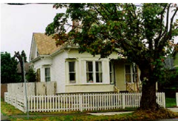
Name: Wood Residence Location: 133 Milton Street Date: 1896