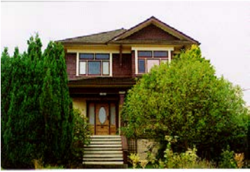
Name: Dykes Residence Location: 639 Kennedy Street Date: 1904

Built in 1913, the Layer-Hall Residence is an excellent example of an Edwardian building with Foursquare and Craftsman influences. The Four square's box plan made it economical and practical to build and the simple design typifies restrained, Edwardian elegance. The Layer-Hall Residence's basic box plan is embellished with Craftsman details including large eave brackets and leaded and stained glass wooden sash casement windows. Although a rear addition alters the original square configuration, the building is substantially intact.