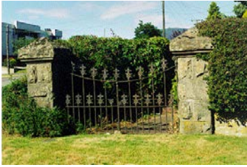
Name: Sloan Estate Gateposts and Stone Wall Location: 201 - 255 Stewart Avenue