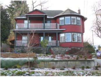
Name: Wilkinson Residence Location: 305 Kennedy Street Date: 1913

Built in 1913, the Wilkinson Residence is Nanaimo's premiere example of the eclectic design trends of the Edwardian era. The Craftsman-influenced river rock foundation, Classical style porch columns and Edwardian era vertical proportions of the building are evidence of this trend. The building is further distinguished by a two-storey high rounded turret on the front façade, stained glass window panels and sidelights and a roofed second floor balcony.