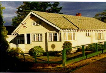
Name: Beattie Residence Location: 825 Fitzwilliam Street Date: 1910

The Shaw Residence is part of a significant cluster of exceptionally intact and well maintained historic buildings in this neighbourhood.