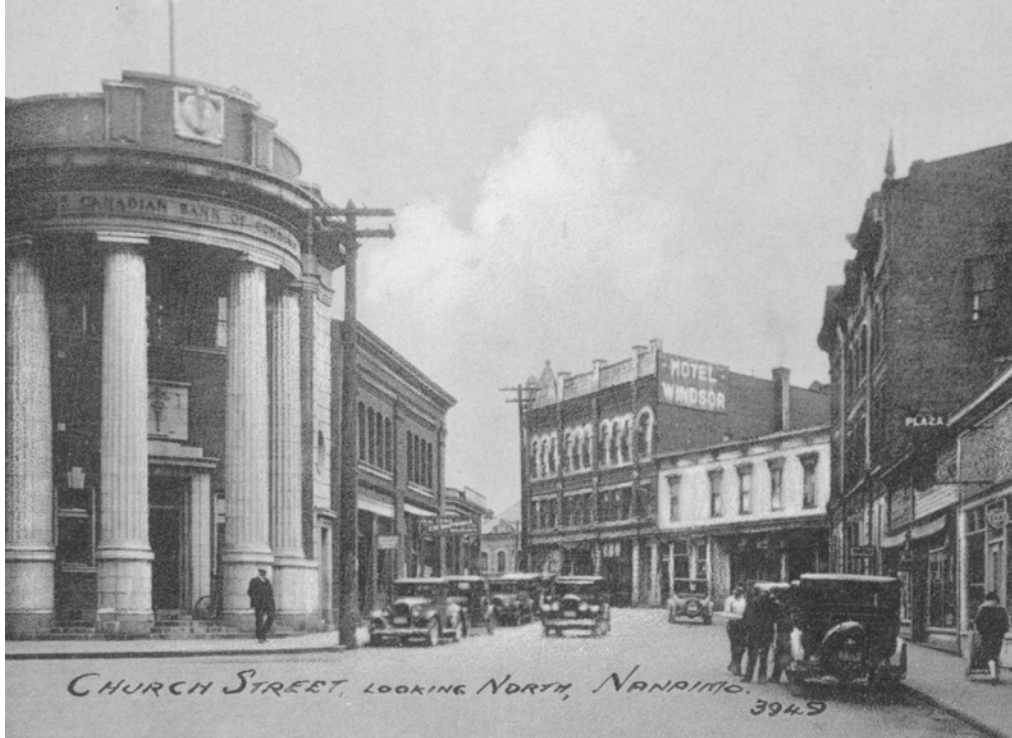
Church Street, Nanaimo BC (circa 1920s)