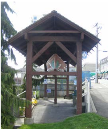
Name: Dugout Canoe

In the Victorian era most cities were illuminated by gas light. In 1817, Baltimore became the first city in North America to have gas street lights installed, but it was a number of decades before the technology improved sufficiently to become inexpensive and reliable. One of the great advances was a gas mantle invented in Heidelberg in 1885 by Carl Auer von Welsbach, a pupil of Professor Robert von Bunsen. Welsbach made a hood of finely woven long-staple cotton, saturated in rare earth oxides, that, when ignited over an upright Bunsen burner, provided illumination without a flame, and doubled the light level with half the amount of gas. The Welsbach mantle proved to be popular, and provided stiff competition to electrical illumination.