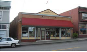
Name: Mitchell's Market Location: 411 Fitzwilliam Street Date: 1922

Built in 1922 by Thomas B. Mitchell to house his market and meat shop, the building exemplifies the type of simple, functional commercial structure commonly built in Nanaimo during the interwar period. Both the large front windows, designed to showcase merchandise, and the rear loading bays emphasize the building's functionality. Later renovations significantly modified the building's original appearance but its essential form is still intact.