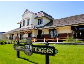
Name: Esquimalt & Nanaimo Railway Station Location: 321 Selby Street Date: 1920

This Late Victorian cottage survives mostly in its original configuration (a second floor was removed), and is one of the best surviving examples of this type of house in Nanaimo. Square and symmetrical in design, with a central front entry, it is covered with a pyramidal roof that extends over the paired front bays to form a small porch. The front bays display decorative carved brackets at the eave line. The front door is original, with arched top panels, and retains its sidelights and transoms. The Gilbert Residence still sits on its original large property, with many mature shrubs and landscape features typical of the period, including variegated hollies. One of the most remarkable features is the unique wrought iron front gate and gateposts, manufactured by the Stewart Company of Cincinnati, Ohio; decorative cast metal was generally removed from older houses during the Second World War as a result of 'scrap metal drives'.