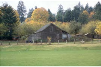
Name: Stark's Barn Location: 1526 Extension Road Date: Circa 1880

Built around 1912, the farmhouse is a very good example of an Edwardian bungalow. Characteristics of this style include the simple, boxy form, horizontal lapped, twin bevelled wooden siding, double hung wooden sash windows, stained glass in living room window, cross gable roof, side gable dormers with hip returns, and full open front verandah with square chamfered columns. The building's solid, substantial appearance and minimal decoration reflects the era's move away from the ornamental excesses of the Victorian era and its function as a working farmhouse.