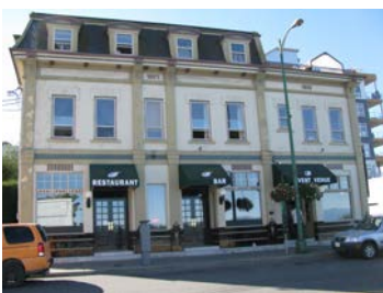
Name: Globe Hotel Location: 25 Front Street Date: 1887 (rear addition 1913) (side addition 1936)