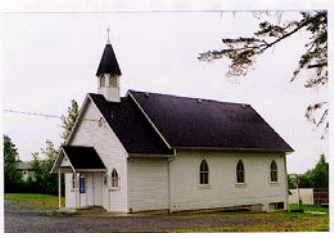
Name: Our Lady of Good Counsel Roman Catholic Church Location: 4334 Jingle Pot Road Date: 1938

Built in 1938, the Our Lady of Good Counsel Roman Catholic Church building is a very good example of Gothic Revival architecture, a popular style for churches in this period and typified by its overall vertical emphasis and pointed arch windows. The building's modest proportions and minimal ornamentation reflect its construction during the Depression.