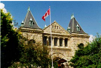
Name: Nanaimo Court House Location: 31-35 Front Street Date: 1895-1896

Tom Brown's Autobody building is part of a grouping of historic buildings located on the only downtown thoroughfare that runs parallel to the waterfront. The rear of the building faces the waterfront and is a highly visible landmark from both the water and from the harbour walkway below.