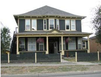
Name: Rowe Residence Location: 545 Haliburton Street Date: Circa 1906

Located prominently to Haliburton Street this is a relatively intact reminder of the type of housing that once dotted this area of Nanaimo and provided housing for the miners' and their families.