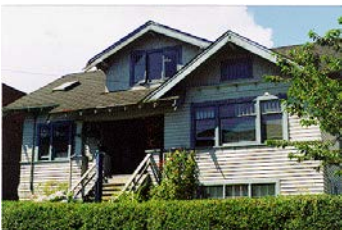
Name: Reid Residence Location: 151 Skinner Street Date: 1921

The ornate and unusual Sullivan Residence, located on a gently sloping site, is a neighbourhood landmark.