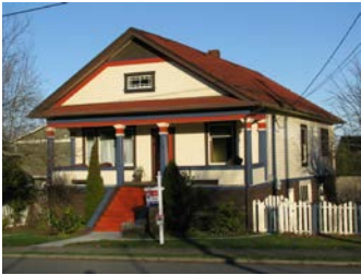
Name: Cowman Residence Location: 150 Kennedy Street Date: Circa 1918

The Church building is significant as an example of building preservation. Originally located in Lantzville, just north of Nanaimo, the building was moved to its current location and maintained in mostly original condition, including much of the interior.