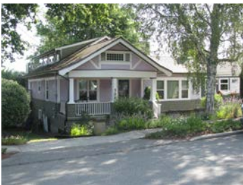
Name: Freethy Residence Location: 304 Kennedy Street Date: 1911

The building is prominently oriented to Kennedy Street and forms a unique part of a larger grouping of residential buildings in the city's old city quarter.