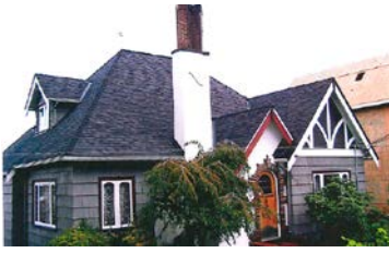
Name: Leynard Residence Location: 442 Milton Street Date: Circa 1932

Built for the Leynard family around 1932, the residence is a very good example of the English Cottage Style that was very popular in Nanaimo during the interwar period. Design features representative of this style include the asymmetrical floor plan, steeply pitched gable and hip roofs and the early use of stucco siding. The building is substantially intact.