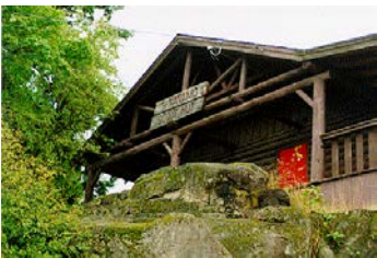
Name: First Nanaimo Scout Hut Location: 445 Comox Road Date: 1930

The building forms part of a significant cluster of heritage buildings located at the intersection of Commercial, Church and Chapel Streets and has a prominent street presence due to its location flush with the Commercial Street right-of-way.