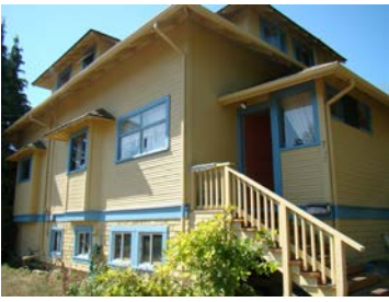
Name: Girvin Avenue Residence Location: 797 Girvin Avenue Date: Circa 1912

The Girvin Avenue Residence is significant as one of the oldest buildings in a neighbourhood just north of the downtown core. Although the area was surveyed before the end of the 19th century, it remained sparsely settled until after the end of the Second World War. Until that time, most of the properties in this area were small-scale farms that supplied local markets. Today, surrounded predominantly by post war tract housing, the residence is a rare reminder of the neighbourhood's original character and function.