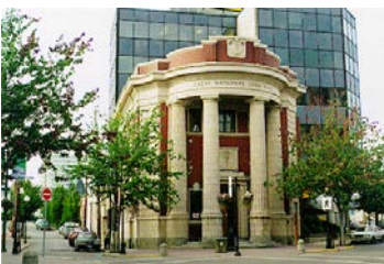
Name: Bank of Commerce (now Great National Land Building) Location: 5-17 Church Street Date: 1914

Two stories in height, with a flat roof, the building marks a prominent intersection. The facades display highly ornamental detailing, including segmental arched window openings with projecting heads and keystones, brick pilasters with recessed lines, and projecting stringcourses. The original double-hung wooden windows have also survived. This Downtown landmark was designated as a municipal heritage site in March of 1977.