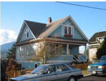
Name: Parrot Residence Location: 411 Machleary Street Date: 1916

The Johnston Residence is part of a grouping of heritage buildings in one of the City’s oldest neighbourhoods, adjacent to the downtown core. The residence is located on a sloping lot with sympathetic modern planting and an excellent view of Harewood.