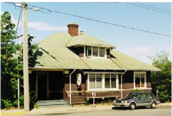
Name: Shaw Residence Location: 41 Chapel Street Date: 1921

A good example of early adaptive re-use, the building, original a residence known as the McDonald Property, was substantially renovated in 1932. Renovations included removing the interior partitions, setting the house on a concrete foundation and covering the outside in stucco. Since that time, the building has remained remarkably unchanged and continues to serve the function for which it was renovated.