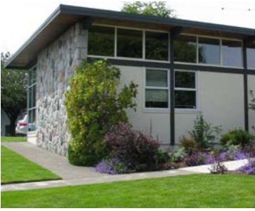
Name: Vancouver Island Regional Library Location: 580 Fitzwilliam Street Date: 1961

The Vancouver Island Regional Library is a very good example of West Coast vernacular style. Developed after World War 2, this regional style typically used post and beam construction which allowed for greater freedom in the positioning of windows and partitions than did standard stud construction. The style's modern ambience was appropriate for new institutional buildings such as libraries.