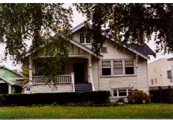
Name: Galbraith Residence Location: 164 Mount Benson Street Date: 1923

The Milton Street Bungalow is located on a half-lot within a grouping of heritage buildings in of the City's oldest neighbourhood. While rare in other parts of the City, half-lots are a defining feature of this block of Milton Street. The building is part of a significant concentration of heritage buildings located in one of the City's oldest neighbourhoods, immediately adjacent to the downtown core.