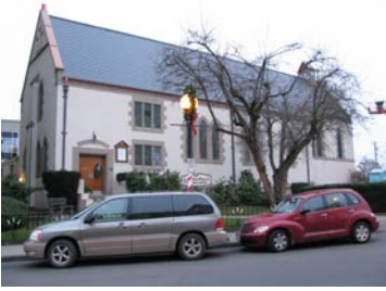
Name: St. Paul's Anglican Church & Hall Location: 100 Chapel Street Date: 1931

St. Paul's Anglican Church is significant as one of the oldest, continuously functioning parishes in British Columbia, linked to both the ecclesiastic history of the province and the earliest social and spiritual development of Nanaimo. Built on land given by the Hudson's Bay Company in 1859, the current building is the third church on the site. Built in 1931, St. Paul's Anglican Church is an excellent and the only identified local example of Gothic Revival architecture, a popular style for churches in this period. The building's modest proportions and minimal ornamentation reflect its construction during the Depression. St. Paul's Anglican Church was designed by architect J.C.M. Keith, best known for Victoria's landmark Christ Church Cathedral.