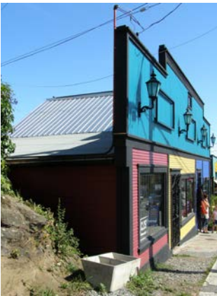
Name: Ranger's Shoes Location: 310 Fitzwilliam Street Date: Circa 1920

The building currently houses the Royal Canadian Sea Cadet Corps Amphion, which was formed in 1943. The corps was named after the HMS Amphion, a Royal Navy submarine active in World War II. The Sea Cadets first occupied the building in 1955 and have been at this location ever since. One of the last remaining buildings of the Nanaimo Military Camp, the building is now surrounded by parking and other buildings that form part of the Vancouver Island University campus.