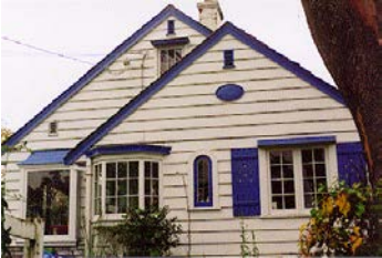
Name: Egdell Residence Location: 725 Terminal Avenue N. Date: 1924

The Galloway Building's large mass and corner location on a major road make it a prominent city landmark.