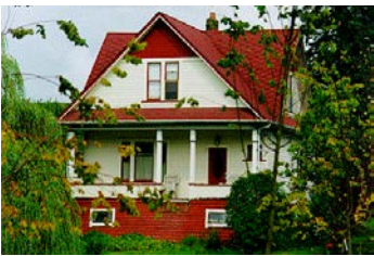
Name: Cranberry Avenue Residence Location: 1500 Cranberry Avenue Date: Circa 1912

The Hendrickson / Maunus Residence forms part of a concentration of Edwardian era farmhouses in the area. Its location, close to the road and on a major road, makes it a neighbourhood landmark.