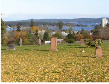
Name: Nanaimo Public Cemetery Location: 555 Bowen Road Date: 1877 to present

Established in 1877 when the city's first cemetery became full, the Nanaimo Public Cemetery is important as a highly visible, tangible link with Nanaimo's past. The modest early grave markers reflect Nanaimo's predominantly working-class population while more elaborate monuments provide the names and tastes of the city's wealthier citizens. Most representative of Nanaimo's history are the many inscriptions about mine accidents, testimony to the over 600 mine-related deaths that occurred in the area from the 1860s to the 1950s. Still in active use, the Nanaimo Public Cemetery functions as a fully accessible outdoor history museum.