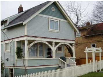
Name: John Johnston Residence Location: 407 Machleary Street Date: Circa 1912

The Hitchen Residence is part of a grouping of superior heritage buildings, located in one of the city’s oldest neighbourhoods adjacent to the downtown core.