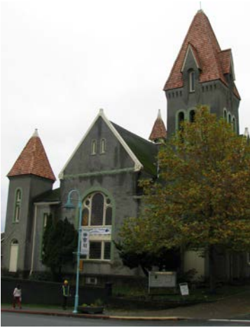
Name: St. Andrew's Presbyterian Church (now St. Andrew's United Church) Location: 315 Fitzwilliam Street Date: 1893 (church hall constructed 1927)

Built in 1893, St. Andrew's United Church is a good example of Late Victorian church architecture. The church follows the square floor plan with second floor horseshoe gallery typical of Late Victorian Presbyterian churches, its original denomination. A large hall at the rear, built in 1927, features a two-storey auditorium with a balcony. The church retains much of its original character despite some later alterations, most notably a stucco finish over the original brick walls.