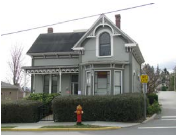
Name: Harris Residence Location: 375 Franklyn Street Date: 1898

The height of the Fourth Street Store Building, particularly in relation to the smaller residential buildings that surround it, and its siting very close to the street make it a neighbourhood landmark.