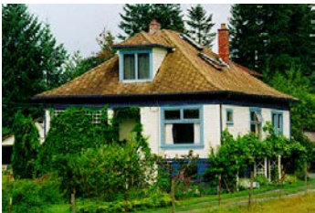
Name: Cranberry Avenue Bungalow Location: 1518 Cranberry Avenue Date: Circa 1912

The Residence is significant as a rare early remaining building in Chase River, an area that originally developed south of Nanaimo as a separate mining and small-scale farming community in the last quarter of the nineteenth century. As Nanaimo grew, the physical distinction between Chase River and Nanaimo blurred. Today, the Chase River area is a mix of commercial and residential buildings but surviving early farmhouses such as this residence, typically sited on large lots, are evidence of the original rural character of the area.