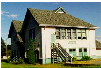
Name: Northfield School Location: 2249 Northfield Road Date: Early 1920s

Located on a narrow triangular lot between two main thoroughfares and at a major intersection, the Fire Hall is an important downtown gateway building and a highly visible landmark.