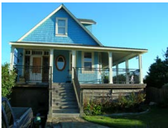
Name: Simpson Residence

This tall house reflects the verticality of the Queen Anne style. A two storey projecting bay runs up the full height of the front façade, and is decorated with 'fishscale' shingles and scroll-cut brackets. There are arched windows in the front gable and in the panelled front door. The large lot retains some early landscape features, including mature shrubs and hedges. The house was built by William Morrison, a tailor, on land acquired from Andrew Haslam; it is unknown if Morrison ever lived here.