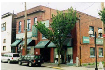
Name: BC Telephone Exchange

The residence stands in contrast to most of the adjacent housing, which was built during the 1950s and 1960s. Consequently, the building is an important heritage landmark on the street.