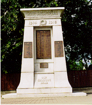
Name: Dallas Square Cenotaph