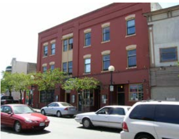
Name: Eagle Hotel (later the Terminal Hotel) Location: 63 Victoria Crescent Date: 1912-1914

The Nanaimo Pioneer Bakery building illustrates the very early importance of Victoria Crescent as a commercial district. The building has been in continuous use as a commercial building for over 125 years, the longest known continuous business use of any building in the downtown area. The Nanaimo Pioneer Bakery building, which follows the curve of the street, is part of a significant grouping of historic buildings in this area.