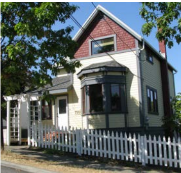
Name: McCourt Residence Location: 750 Franklyn Street Date: Circa 1901

The Franklyn Street Gymnasium is significant because of its association with the prolific Vancouver architectural firm of Gardiner and Mercer, which operated from 1912 to 1940. The firm's surviving buildings include the Trapp Block, Westminster Trust Building and the Nelson House (all in New Westminster) and the Jewish Community Centre, Pacific Athletic Club and the St. Vincent de Paul Hospital (all in Vancouver). The Franklyn Street Gymnasium is representative of the firm's generally conservative design aesthetic.