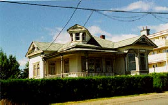
Name: Sullivan Residence Location: 673 Selby Street Date: Circa 1892