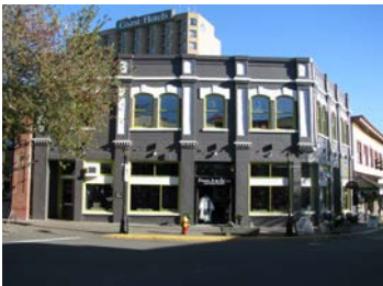
Name: Earl Block Location: 2-4 Church Street Date: Circa 1888-1890