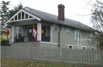
Name: Newbury Residence Location: 39 Milton Street Date: 1910

Prominently located on the corner of Millstone Avenue and Eberts Street, the residence is a highly visible landmark. The building is located in an established neighbourhood surrounded by mature, sympathetic landscaping within a larger grouping of housing from a similar era.