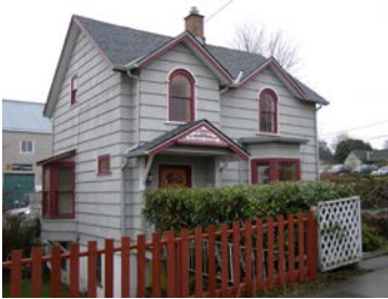
Name: Aldred House Location: 529 Wentworth Street Date: Circa 1890

The building's prominent corner location and exceptional windows make it a highly visible landmark.