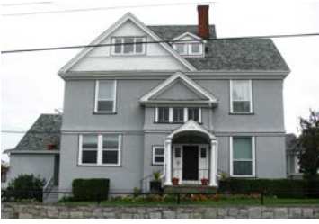
Name: Harrison Residence Location: 546 Prideaux Street Date: 1892

Built around 1892, the Harrison Residence is a very good example of Late Victorian Eclectic architecture. The picturesque massing of the building reflects the Late Victorian enthusiasm for complex roof lines and decorated surfaces. Although some of the ornate chimneys have been removed and the front entry replaced, the building remains essentially intact.