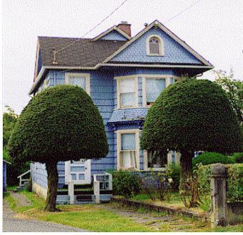
Name: Holland/Morrison Residence