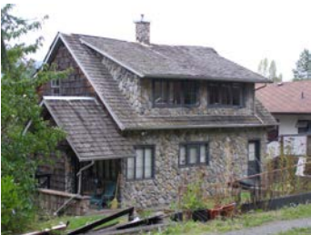
Name: Clements Residence Location: 420 Pine Street Date: 1929

Set in a gracious landscape, mature trees provide a complementary setting at the crest of a hill that slopes away to the west.