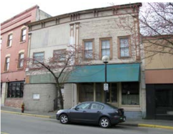
Name: Nanaimo Pioneer Bakery/Johnson's Hardware Location: 39-45 Victoria Crescent Date: Circa 1870s

Located mid-block, Queen's Hotel is prominent on the street and is part of a grouping of historic buildings in this area.