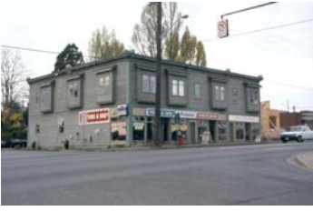
Name: Galloway Building Location: 405 Terminal Avenue N. Date: Circa 1920

The Galloway Building is a significant example of an early commercial building located outside the downtown core. Home to many different businesses over the years, the building's location on one of the city's major thoroughfares took early advantage of the city's northward expansion.