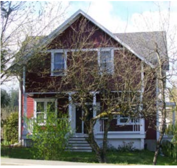
Name: Hendrickson / Maunus Residence Location: 1421 Cranberry Avenue Date: Circa 1913

Built about 1913, the Hendrickson / Maunus Residence is a very good example of an Edwardian era farmhouse. The building's solid, symmetrical appearance and minimal decoration reflects the era's move away from the ornamental excesses of Victorian times. The building's square plan, cross-gabled roofline, full open front verandah, wood siding, remaining original windows and shingle insets in the gable ends are typical features of this style.