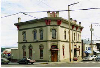
Name: Occidental Hotel Location: 432 Fitzwilliam Street Date: 1886-1887

The Central Dairy building is an integral part of a significant grouping of historic commercial buildings on this street.