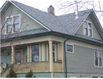
Name: Garland Farmhouse Location: 467 Eighth Street Date: Circa 1912