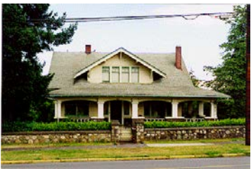
Name: Rowbottom Residence Location: 320 Machleary Street Date: 1913