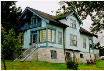
Name: Park Avenue Residence Location: 465 Park Avenue Date: Circa 1913

This striking house is very similar to 746 Railway Avenue, and to 648 and 650 Haliburton Street; these four houses were most likely built by the same builder. The sophisticated design has highly unusual features, including the battered foundation skirting, and the scalloped inset arch over the second floor front and rear balconies. The ornamentation includes scroll-cut vergeboards, and brackets under the projecting side bay. There are inset corner porches at the front and rear, with square chamfered columns. This house was built on a lot subdivided as part of the 'Brookside' subdivision in 1912.