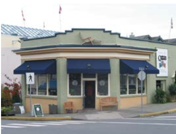
Name: Rawlinson & Glaholm Grocers Location: 437 Fitzwilliam Street Date: 1916

The Occidental Hotel has been in continuous use as an eating and drinking establishment for over 100 years.