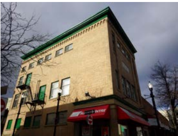
Name: Ashlar Lodge Masonic Temple Location: 101 Commercial Street Date: 1923