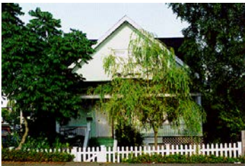
Name: Millstone Avenue Residence Location: 408 Millstone Avenue Date: Circa 1912

A very good example of an early vernacular worker's cottage, the Meredith Road Residence, built around 1900, represents the Nanaimo area's predominant housing form from around 1900 to 1920. Inexpensive to build, the typical worker's cottage features a simple square plan, pyramidal roof and lack of ornamentation. As finances allowed and tastes dictated, improvements such as front verandahs and more elaborate wood trim were often added. The verandah on this building appears to be original and the building, with its original rubble stone foundation, is substantially intact.