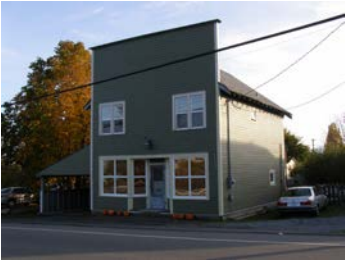
Name: Fourth Street Store Location: 423 Fourth Street Date: Circa 1910

The building is located on a corner lot and is sited prominently on Fourteenth Street. It represents a rare surviving example of the early miner's cottage building form still located on its original site.