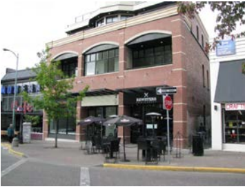
Name: Free Press Building Location: 223 Commercial Street Date: 1893 (façade rebuilt 1956)