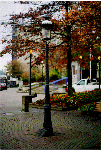
Name: Welsbach Gas Lamp

The Cenotaph is a very good example of a simple, graceful monument. Minimally ornamented, the Cenotaph's design, created and executed by local monument works owner E. Millins, was based on an ancient Egyptian model.