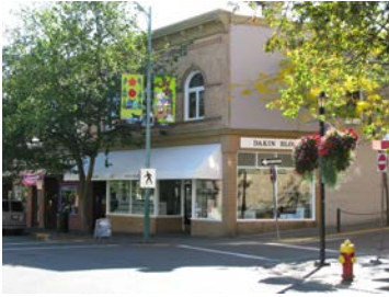
Name: Hirst Block (now Dakin Block) Location: 93-99 Commercial Street Date: 1911

Built in 1911, the Hirst Block is a superior example of the Edwardian-era commercial building style in Nanaimo. The front façade is beautifully detailed with elaborate tan-coloured brickwork and a projecting pressed metal cornice. Three round-arched windows on the second floor have decorative bevelled glass in the upper sash. The building was sensitively rehabilitated as part of a 1985 Downtown Revitalization program.