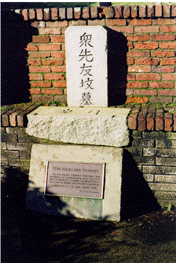
Name: Garden Memorial to Chinese Pioneers Location: 105 St. George Street Date: Circa 1890

One of Nanaimo's older parks, the site is located on the border between two of Nanaimo's oldest historical neighbourhoods, Harewood and the South End, in a lowland area straddling the Catstream.