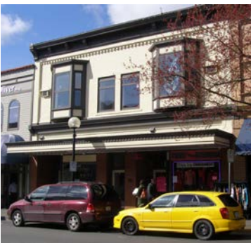
Name: Rogers Block Location: 83-87 Commercial Street Date: 1913

Situated in the middle of one city block of largely intact and similarly scaled buildings, the Hall Block is a significant part of the Commercial Street streetscape.