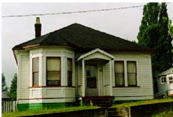
Name: Adams Residence Location: 547 Kennedy Street Date: 1908

The residence is part of a grouping of heritage buildings in this section of one of Nanaimo's oldest neighbourhoods, adjacent to the downtown core.