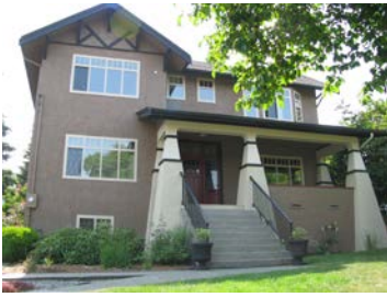
Name: Bird House Location: 461 Vancouver Avenue Date: 1914

Built in 1914, the Bird House is a good example of a Craftsman style home. The house features many design elements typical of this style including half timbering in the gable ends, triangular eave brackets and an open front verandah supported by flared piers. Although the original wood siding has been covered by stucco and most of the original windows replaced or modified, the building is otherwise substantially intact. Of particular note, many of the home's original interior features are intact including the wainscoting, dramatic staircase, art glass windows, built-in sideboard in the dining room, built-in bookcases in the den, cast iron radiators (still in use) and the inlaid oak floors.