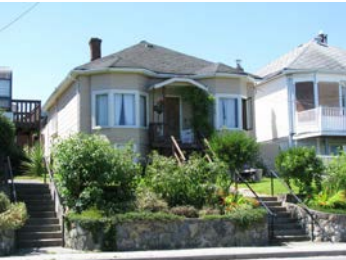
Name: Milton Street Bungalow Location: 469 Milton Street Date: Circa 1892

The building is very prominent on the street and surrounded by sympathetic landscaping.