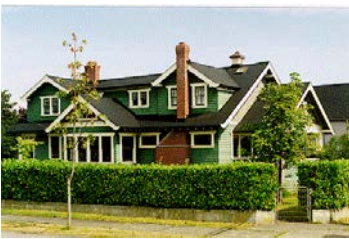
Name: Jenkins Residence Location: 674 Wentworth Street Date: 1924

Aldred House is one of the earliest known buildings in this neighbourhood, just north of the downtown core. Additionally, it is one of few surviving Victorian era buildings of this size and style in Nanaimo. The house is located within a larger group of significant heritage buildings and is prominent to the street.