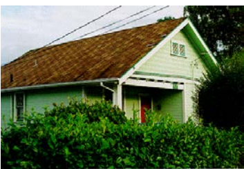
Name: Isherwood Residence Location: 421 Victoria Road Date: 1912

Built around 1892, the Victoria Road Residence is a very good example of a Late Victorian cottage with superior carpenter ornamentation, including turned columns, jig-cut detailing and decorative diagonal planking. Sympathetic modern plantings provide an appropriate setting.