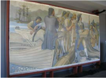
Name: EJ Hughes Mural Location: 100 Gordon Street Date: 1938 (restored in 2009)

The EJ Hughes Mural is an excellent example of a community-driven historic conservation project. From the summer of 1996 when the mural was first salvaged from the old Malaspina Hotel (38 Front Street) until the spring of 2009 when it was fully rehabilitated and installed in the Vancouver Island Conference Centre, numerous community groups, individuals and all three levels of government, most notably the City of Nanaimo, worked together to ensure project completion. The Hughes Mural restoration exemplifies Nanaimoites' patient determination and commitment to its heritage and public art.