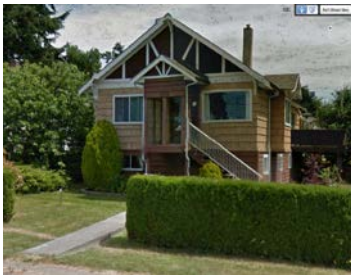
Name: Lewis Residence Location: 130 Howard Avenue Date: Circa 1911