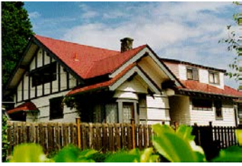
Name: Johnston Residence Location: 36 Stewart Avenue Date: 1912

The Johnston Residence is a superior example of Craftsman style architecture. Built in 1912, the house displays many sophisticated features. The complex gable roof covers a bungalow form, with a corner entry, projecting bays and an unusual round projecting bay at the southwest corner. Stained glass panels and straight-ledged glass are used as decorative features. Half-timbering in the gable ends, triangular eave brackets, and exposed rafter ends are other hallmarks of the Craftsman style. The Johnston Residence is substantially intact.