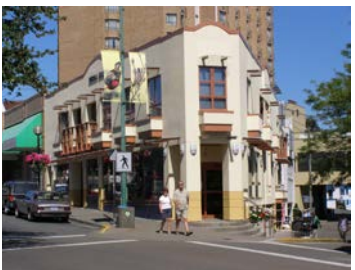
Name: Gusola Block Location: 120 Commercial Street Date: Circa 1937