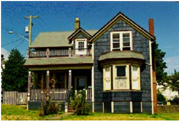
Name: McRae Residence Location: 98 Victoria Road Date: 1901