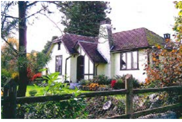
Name: Beevor-Potts Residence Location: 627 Millstone Avenue Date: Circa 1930

Built around 1930, the Beevor-Potts Residence is a very good example of the English Cottage Style that was very popular in Nanaimo during the interwar period. Design features representative of this style include the asymmetric floor plan, jerkin headed and steeply pitched gable roofs and the early use of stucco siding. The building is substantially intact.