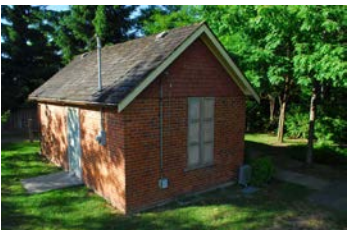
Name: Brick Cottage Location: 1904 Jingle Pot Road Date: Circa 1910-1912