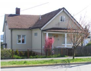
Name: Jones/Bevilockway Residence Location: 55 Haliburton Street Date: Circa 1875

Building in 1912, the Girvin Avenue Residence is a very good example of an Edwardian bungalow. The building displays many of the features typical of the style and era including a simple, square plan, an inset full open front verandah supported on square columns and a hip roof with hipped dormers.