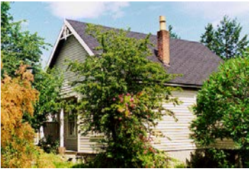
Name: Crewe Residence Location: 624 Wakesiah Avenue Date: 1900

Frederick Crewe, a miner, is listed as living at this site in Five Acres as early as 1900, and it is likely that this house dates from approximately that time. This simple rectangular structure has an inset corner porch, and a full open front verandah that faces the rear lane. This is possibly the oldest surviving house in the Five Acres area, and has been maintained in good condition. A concrete milk house remains on the Wakesiah Avenue side of the property, and the concrete foundations of a barn exist on the adjacent lot to the south, recalling the agricultural legacy of the area.