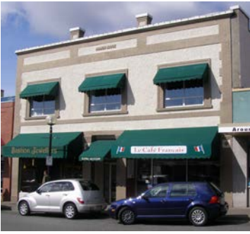
Name: Parkin Block Location: 143-155 Commercial Street Date: 1922

Designed by local architect and contractor Daniel Egdell and built in 1922, the Parkin Block is a very good example of the type of vernacular commercial building built in downtown Nanaimo just after the First World War. The building continues the traditional appearance of the Edwardian-era but has a more eclectic façade treatment. Predominantly stucco, the façade is highlighted by simple brick detailing that outlines the edges of the building and structural elements.