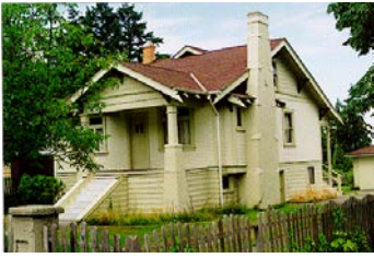
Name: Beck Residence Location: 610 Selby Street Date: 1921