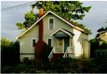
Name: Shaw Residence Location: 815 Fitzwilliam Street Date: 1910

The Vancouver Island Regional Library speaks to the municipal government's earliest attempt to streamline community services for efficiency and easy public access. By the mid-1960s, the police station, health unit, library and fire hall were all located in what was historically known as Lubbock Square, just outside the downtown core. The library and health unit have since moved to other locations. The fire hall and main police station remain and are tangible reminders of the area's early importance as a central location for most of the city's protective and community services.