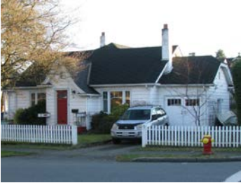
Name: Tuck Residence Location: 959 Wentworth Street Date: Circa 1936

Located on a corner lot within one of Nanaimo's oldest neighbourhoods and prominent to the street with mature landscaping, this residence forms part of a grouping of historic residential buildings adjacent to the downtown core.