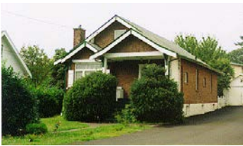
Name: Sharp Residence Location: 261 Vancouver Avenue Date: 1923

The Schetky Residence's grounds represent the type of landscaping that was favoured for Nanaimo's upscale neighbourhoods in the late 19th and early 20th centuries. The mature Chilean Pine (Monkey Puzzle Tree) on the site is listed on the City's register of heritage trees. These trees were a popular fad before World War 1 and were often brought in by ship's crews as souvenirs when they stopped to refuel in South America. Often given as gifts, they were planted singly or in pairs in front yards. Other landscape features include mature holly trees, lilac bushes, rose bushes along the walk and a Japanese Plum. The grounds have a historical and physical relationship to the building and, as such, are an important component of the site's value. The residence's location at a busy intersection and the massive Chilean Pine in the front yard make it a neighbourhood landmark.