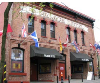
Name: Palace Hotel Location: 275 Skinner Street Date: 1889

Built in 1921, the Reid House is a very good example of the late Craftsman style. The Reid House has many of the features typical of this style including finely crafted wood detailing.