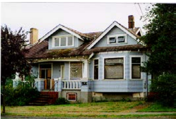
Name: Jones Residence Location: 639-41 Prideaux Street Date: 1907

The residence's height, mass and its location on a high rocky outcropping make it a highly visible landmark.