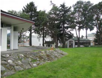
Name: Piper Park Location: 100 Cameron Road Date: 1980

Sited on a large acreage at the crest of a hill and on a main thoroughfare, the Nanaimo Public Cemetery is a highly visible landmark.