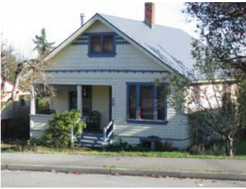
Name: Pine Street Bungalow Location: 20 Pine Street Date: Circa 1918

This striking house is very similar to 746 Railway Avenue, and to 648 and 650 Haliburton Street; these four houses were most likely built by the same builder. The sophisticated design has highly unusual features, including the battered foundation skirting, and the scalloped inset arch over the second floor front and rear balconies. The ornamentation includes scroll-cut vergeboards, and brackets under the projecting side bay. There are inset corner porches at the front and rear, with square chamfered columns. This house was built on a lot subdivided as part of the 'Brookside' subdivision in 1912.