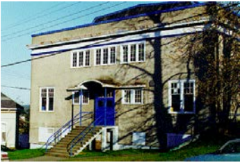
Name: Franklyn Street Gymnasium Location: 421 Franklyn Street Date: 1922

The Franklyn Street Gymnasium has been in continuous use as a gymnasium and auditorium since 1922. Although the school that the gymnasium and auditorium once serviced is no longer standing, the building continues to function as a gymnasium and neighbourhood community centre.