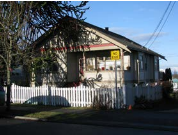
Name: Pargeter Residence Location: 536 Kennedy Street Date: 1913

The residence is part of a grouping of superior houses that exemplifies the neighbourhood's early identity as a prestigious residential area.