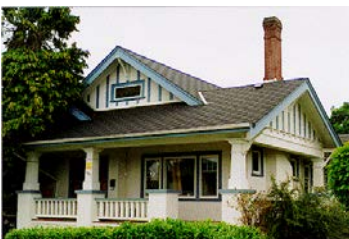
Name: Wilson Residence Location: 697 Wentworth Street Date: 1926

Located at an intersection within a grouping of significant heritage buildings, the Jenkins Building is a highly visible neighbourhood landmark.