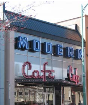
Name: Modern Café Location: 221 Commercial Street Date: 1910 (façade rebuilt 1950s)

Illustrating Nanaimo's early commercial development, the A.R. Johnston Block is one of very few pre-1900 buildings still standing. The building was part of a complex that included a store, warehouse and wharf and originally backed onto Nanaimo's now infilled inner harbour. The siting underlines the historic importance of harbour access and water transportation to early merchants operating in isolated Nanaimo.