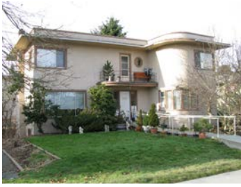
Name: York Residence Location: 908-912 Hecate Street Date: 1948

Built in 1948, the York Residence is a very good example of a vernacular Streamline Modern style building. The York Residence's sleek, streamlined appearance, its horizontal orientation, smooth surfaces and curved corners and balcony are hallmarks of this modernistic style.