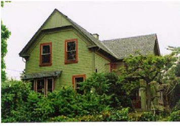
Name: Wilton/Welch Residence Location: 129 Milton Street Date: 1903

Built in 1903 and expanded in 1916, the Wilton-Welch Residence is a very good example of a vernacular, Edwardian era building. The simple, L-shaped plan has an overall restrained appearance that is enriched by carpenter ornamentation including scroll-cut eave brackets and contrasting tongue-and-groove in detailing in the front gable and along the eave lines. A major rear addition in the 1970s does not significantly impact the overall appearance of the house.