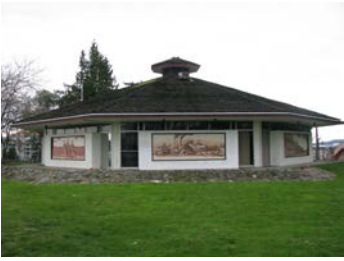
Name: Nanaimo Centennial Museum Location: 100 Cameron Road Date: 1967

Built in 1967 as a legacy project for Canada's 100th anniversary, the Nanaimo District Museum building is a good example of modern, vernacular institutional architecture. Reflecting the trend toward diverse, eclectic architectural modernism, the quirky octagonal design was meant to symbolically echo the design elements of the nearby Bastion, constructed by the Hudson Bay Company (1853-1855).