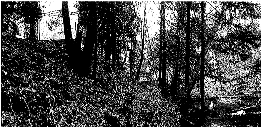
Photo 4 – Looking northwards along bank of Beck Creek adjacent to #115 showing frequent curved and leaning tree trunks indicative of slope movement