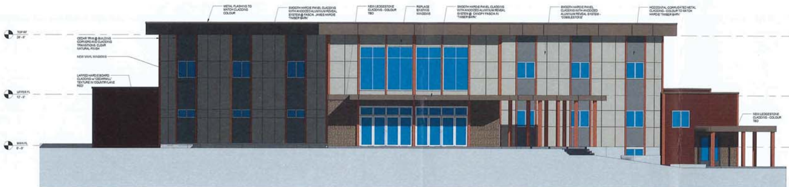
1 ELEVATION - FRONT 1/16

GENERATIONS CHURCH ENVELOPE REMEDIATION Enter address here Owner