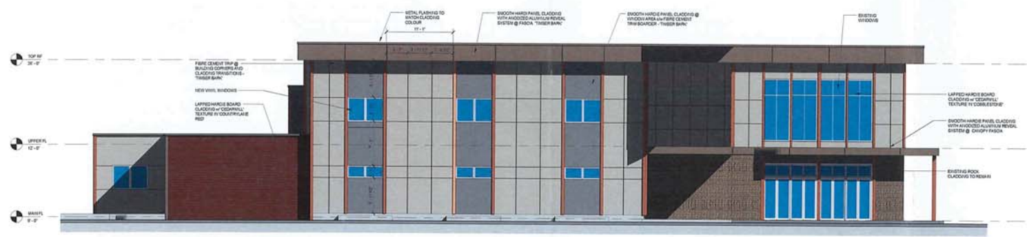
2 WEST ELEVATION 1/16