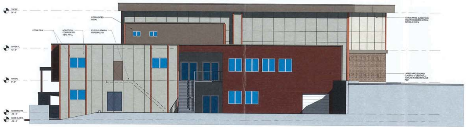
2 SIDE ELEVATION - SIDE 1/16