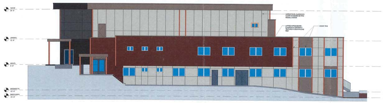
1 REAR ELEVATION 1/16