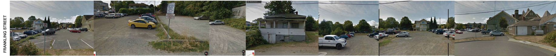
350 FRANKLIN STREET