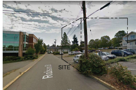
PHOTO OF ROBSON STREET LOOKING EAST