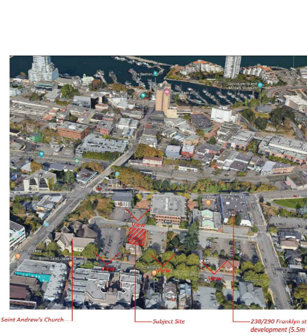
8 SCHEMATIC VIEW ANALYSIS DP08 1:25

OMICRON ARCHITECTURE ENGINEERING LTD. This drawing is a copyright material of service and remains the property of Omicron Architecture Engineering Ltd. It is to be used for the project only. Information contained herein may not be used or reproduced in any form without the written permission of Omicron Architecture Engineering Ltd. Changes shall not be made. The Contractor shall verify and be responsible for all dimensions, notes, and details. payment to securing the work. Discrepancies and variations shall be reported to the Contractor prior to construction. In all cases, the latest issue of the drawing shall be used for the construction of the work. The Contractor shall ensure that the project is completed in accordance with the drawing as issued. Changes shall not be made. The Contractor shall verify and be responsible for all dimensions, notes, and details. All work shall conform to the latest editions of local Building Codes, standards, codes, and local ordinances. Drawing sheet numbers are provided as follows: A = Architectural E = Electrical S = Structural P = Plumbing M = Mechanical/HVAC L = Landscaping P = Planning C = Civil