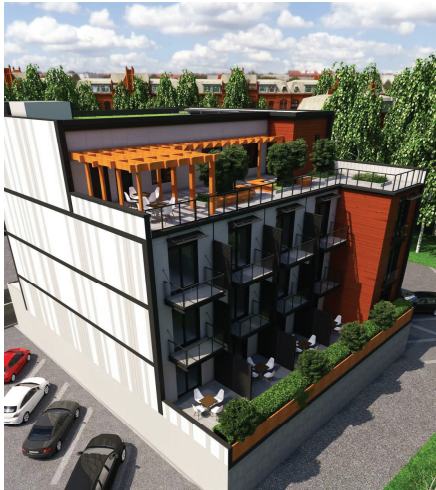
5 REAR VIEW RENDERING DP08 1:25