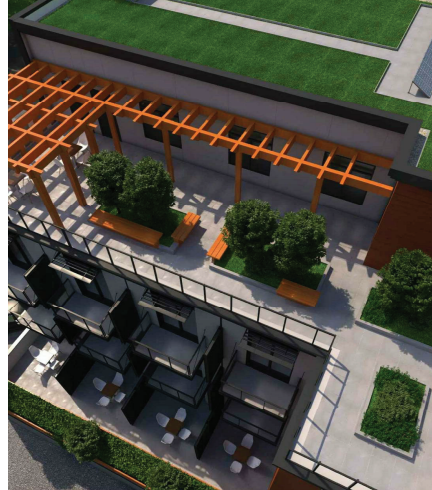
7 REAR VIEW RENDERING #2 DP08 1:25