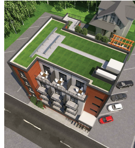
4 VIEW FROM ABOVE RENDERING DP08 1:25