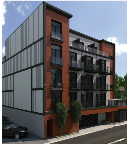
3 FRONT VIEW RENDERING #2 DP08 1:25