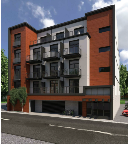
1 FRONT VIEW RENDERING DP08 1:25