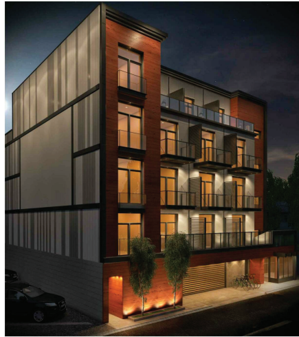
2 NIGHT FRONT RENDERING DP08 1:25