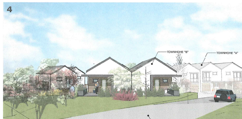
LOOKING NORTHEAST ALONG EXTENSION ROAD