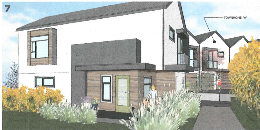
7 FRONT ELEVATION OF TOWNHOME A (ALONG EXTENSION ROAD) PRIVATE FRONT ENTRY