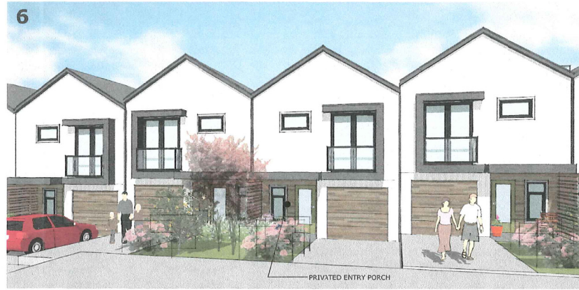
6 FRONT ELEVATION OF TOWNHOME A (ALONG ACCESS LANE)