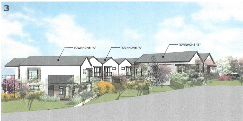
LOOKING EAST ALONG EXTENSION ROAD