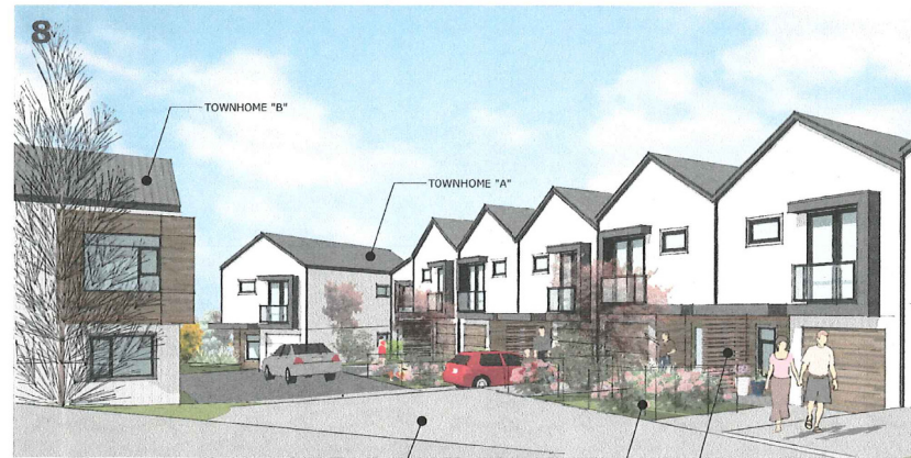
8 VIEW FACING NORTHEAST (ACCESS LANE) ACCESS LANE SCREEN TO CREATE PRIVACY NATURALLY LANDSCAPE FRONT YARDS

RECEIVED RA399 AUG 20 2018 CITY OF NANAIMO COMMUNITY DEVELOPMENT