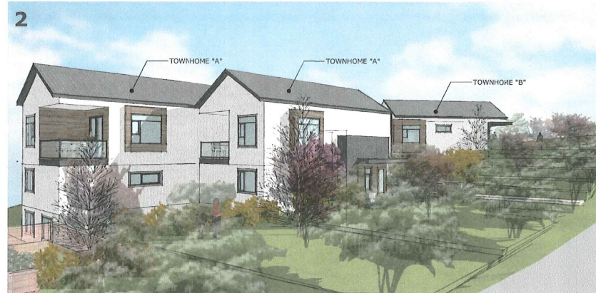
LOOKING SOUTH ALONG EXTENSION ROAD