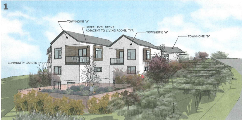
LOOKING SOUTH ALONG EXTENSION ROAD