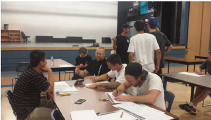
|| Youth "Jam" Held July 23rd, 2015 ||