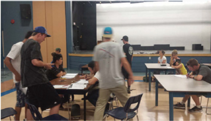
Technical Sessions Held December 15th, 2015 as well as April 4th and 25th, ...2016