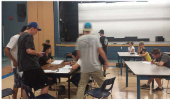
Technical Sessions - Held 2015-DEC-15 as well as 2016-APR-04 and 2016-APR-25