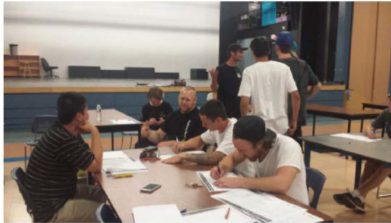
Youth "Jam" - Held 2015-JUL-23