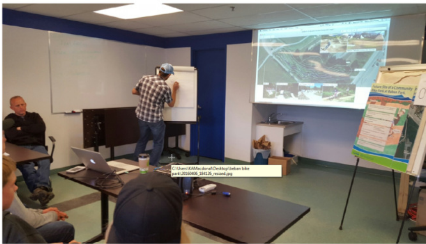
Design Workshop — 2016-APR-06