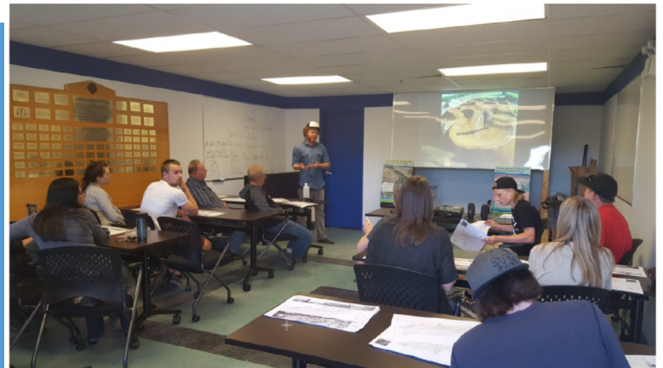
Design Workshop — 2016-MAY-04