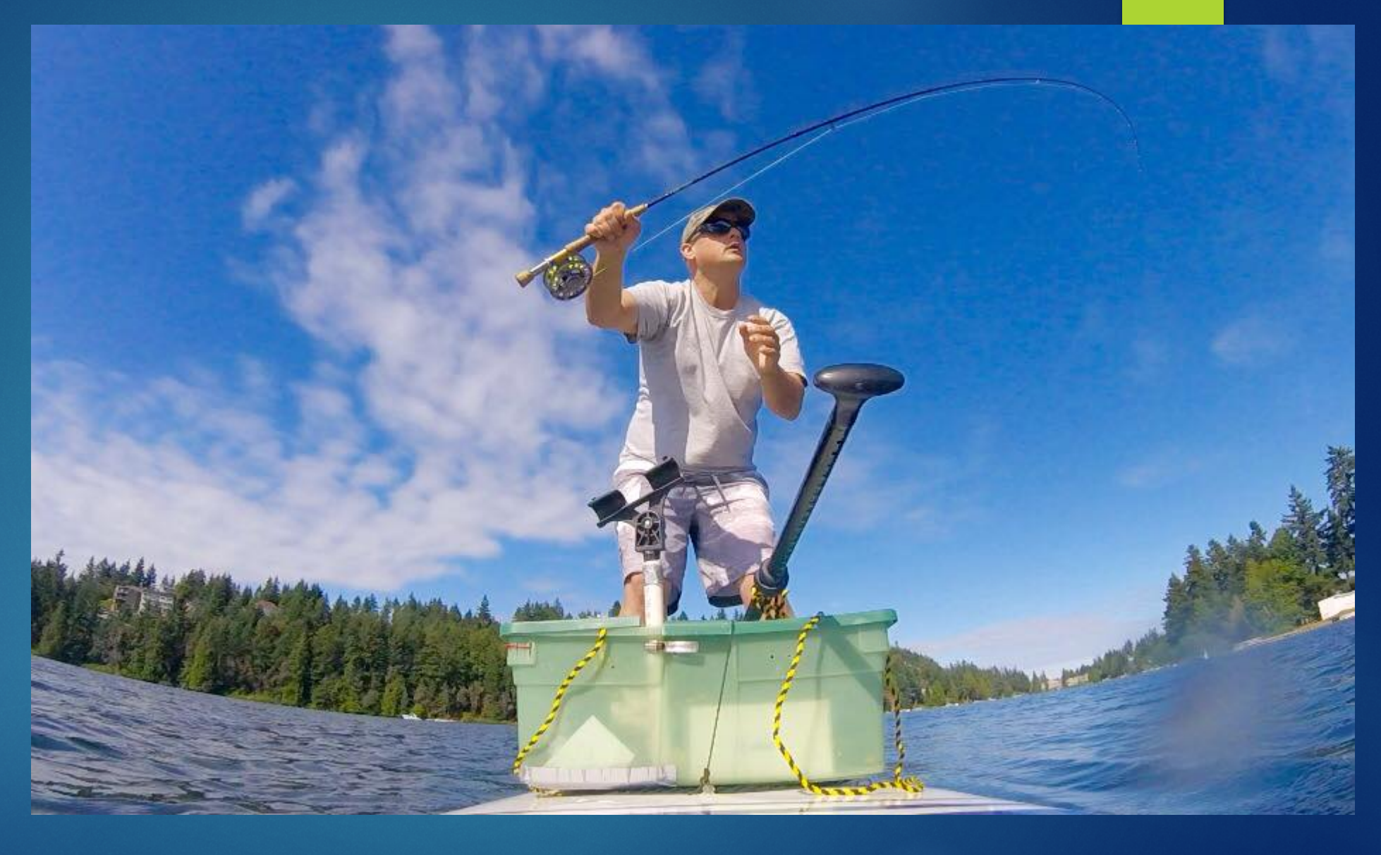
Paddleboard Fishing on Long Lake, Nanaimo BC. Summer 2016

I am now chasing my dream of being a paddleboard instructor and offering rentals and lessons at the beautiful Westwood Lake here in Nanaimo.