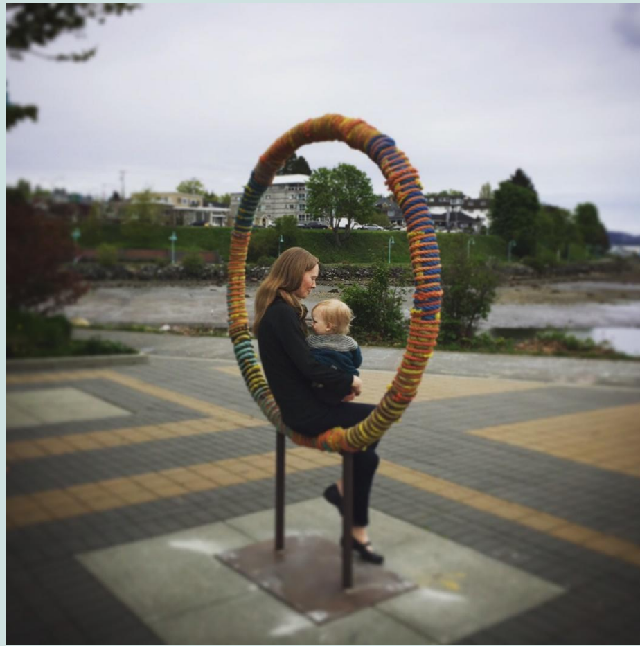
“Portal” Location: Maffeo Sutton Park