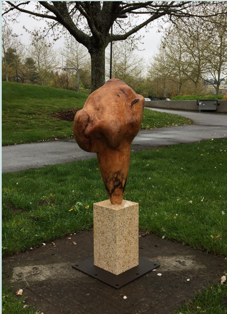
"Paleo dentriticus I" Location: Maffeo Sutton Park