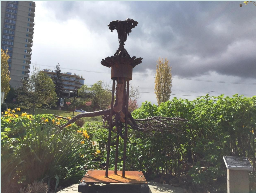
“The Core II” Location: Maffeo Sutton Park