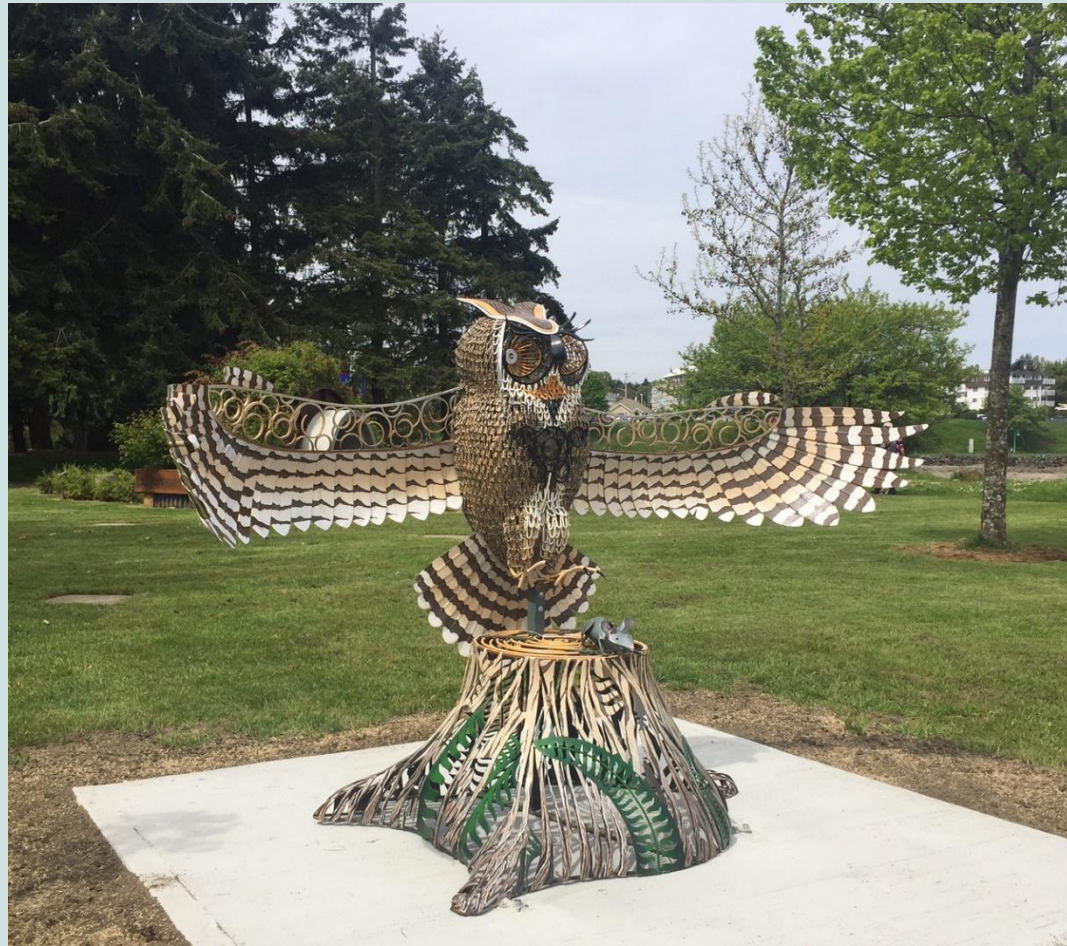
“Lunar Flyer” Location: Maffeo Sutton Park