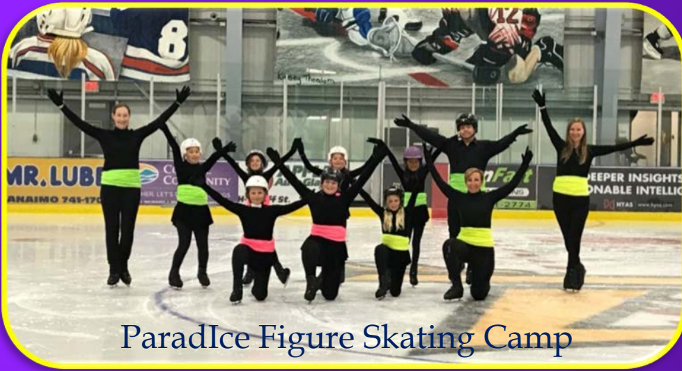
ParadIce Figure Skating Camp