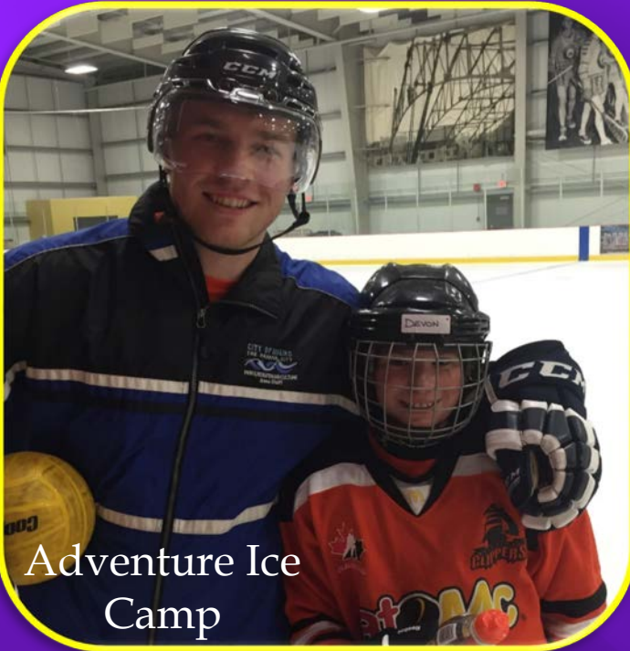
Adventure Ice Camp