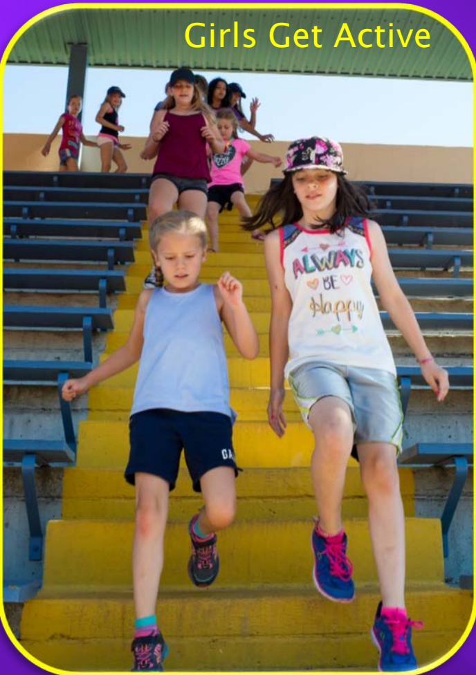
Girls Get Active