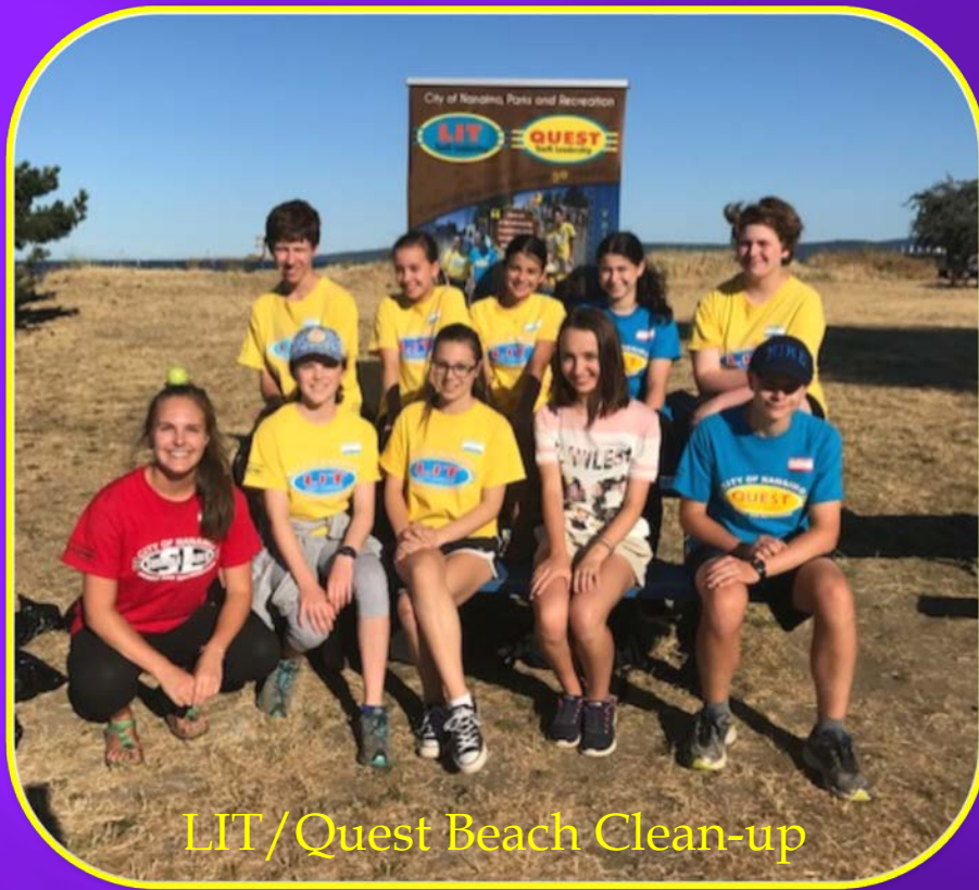
LIT/Quest Beach Clean-up