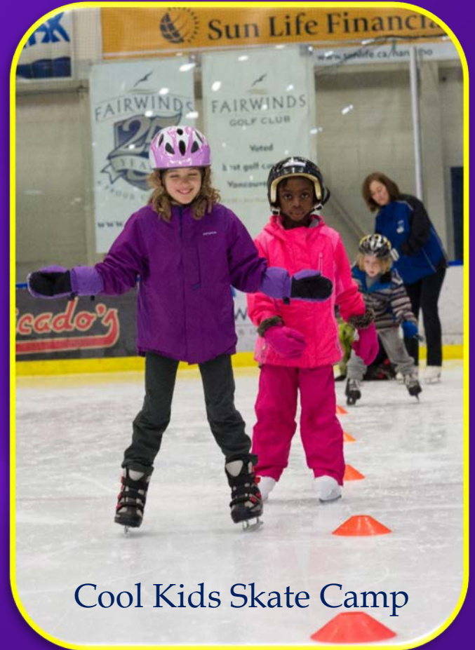
Cool Kids Skate Camp