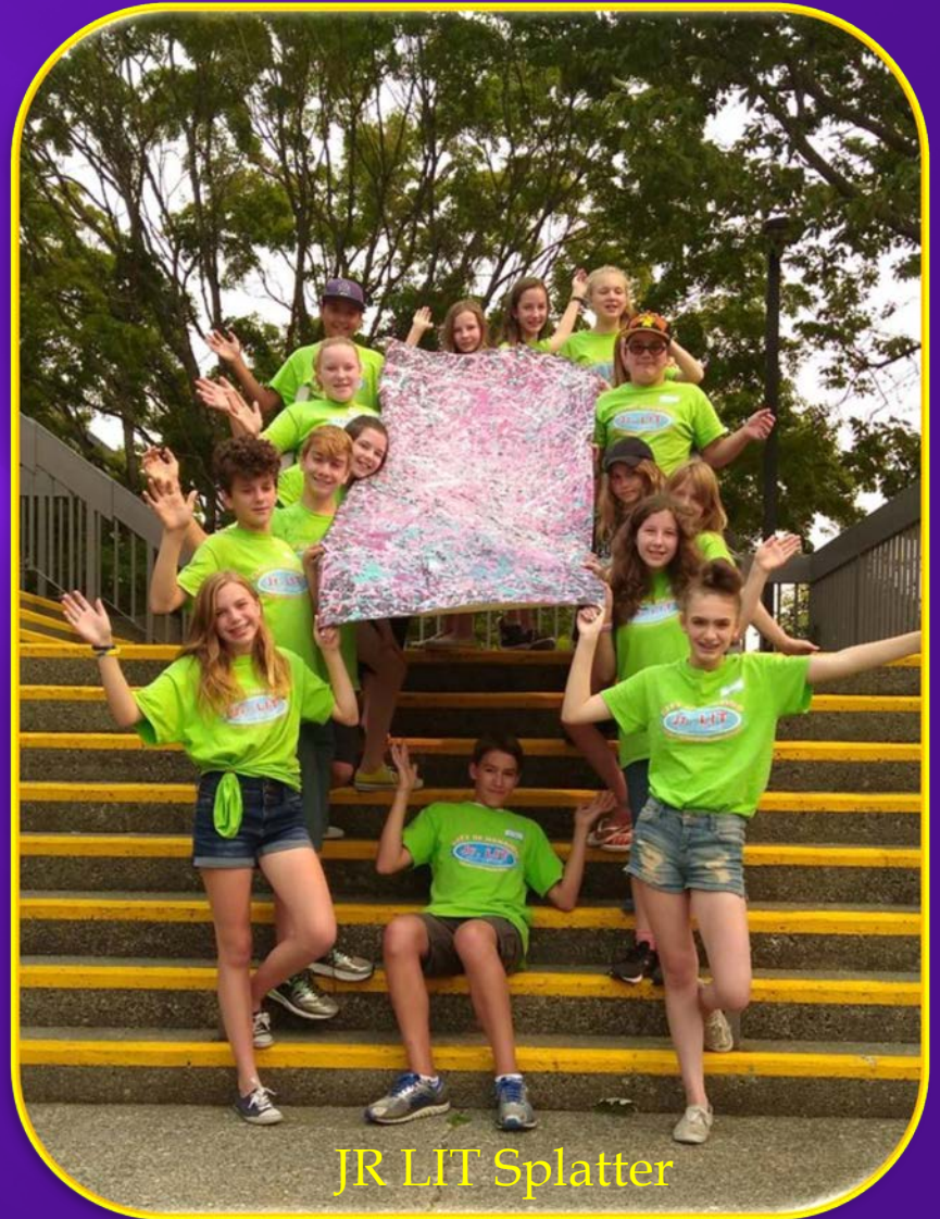
JR LIT Splatter

2017 marked the 35 th year of this program