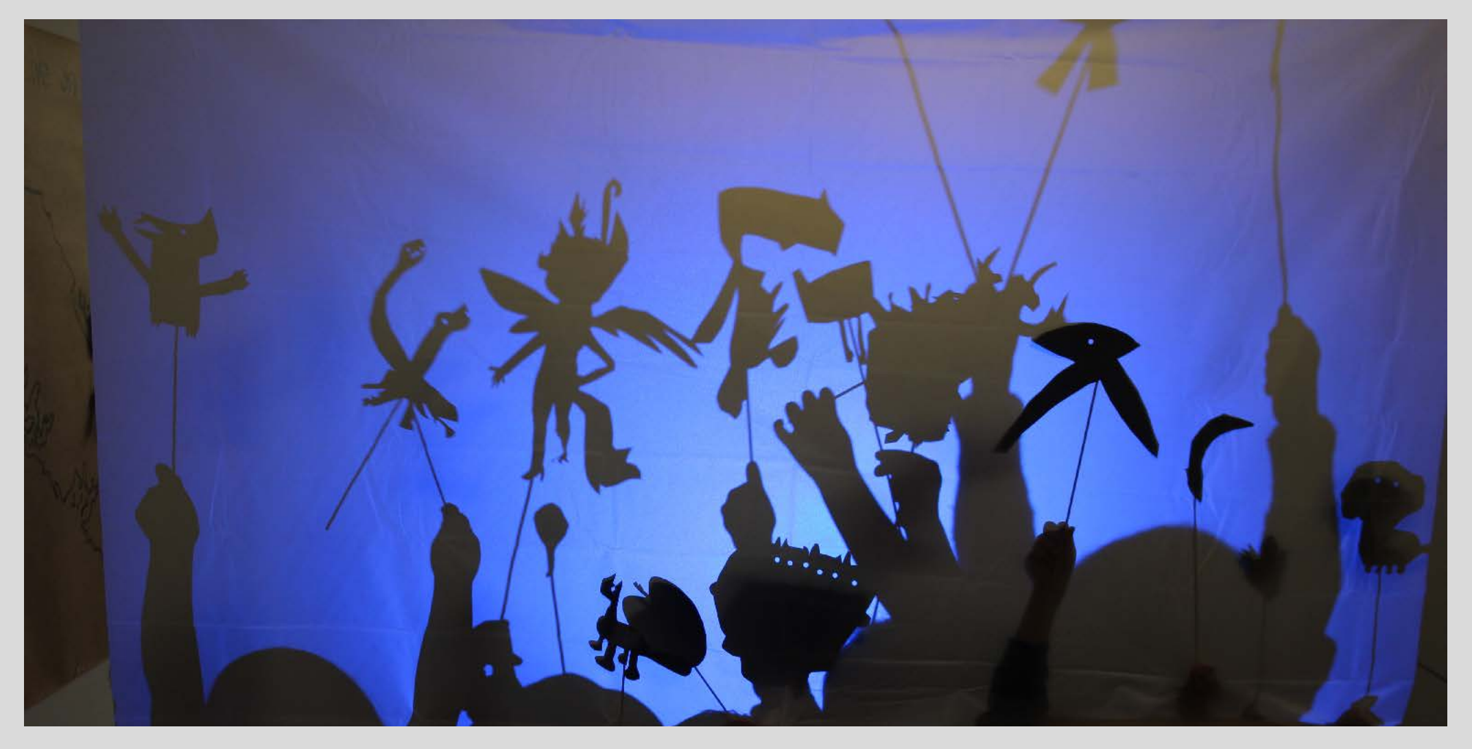
"I appreciate the diversity of works and themes you bring to us, and the many classes and workshops offered for all ages. We are fortunate to have these creative opportunities here in Nanaimo..."