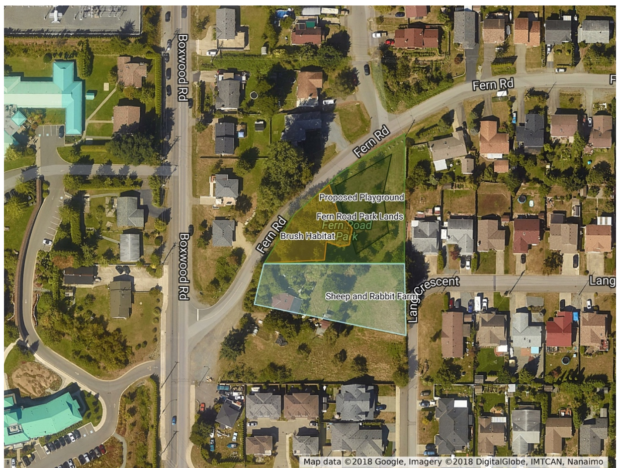
Figure 2 – overview of Fern Road Park Site